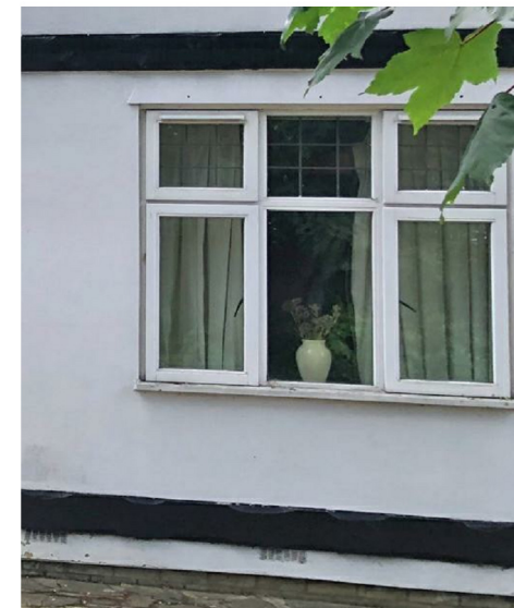
03 EXISTING WINDOW / EXTERNAL VIEW TUDOR LODGE HOTEL PLANNING COND APP 02