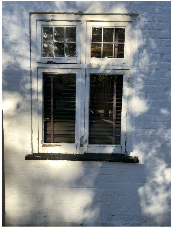
04 EXISTING WINDOW / EXTERNAL VIEW