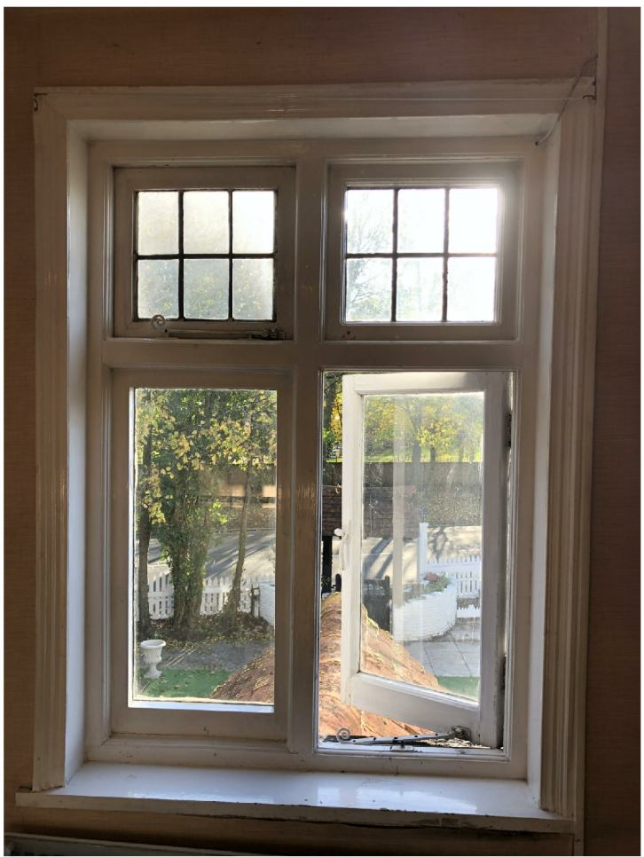
03 EXISTING WINDOW / INTERNAL VIEW