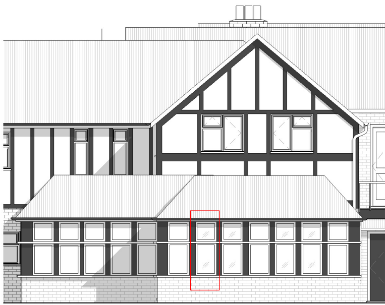
05 KEY ELEVATION 1:100 @ A3