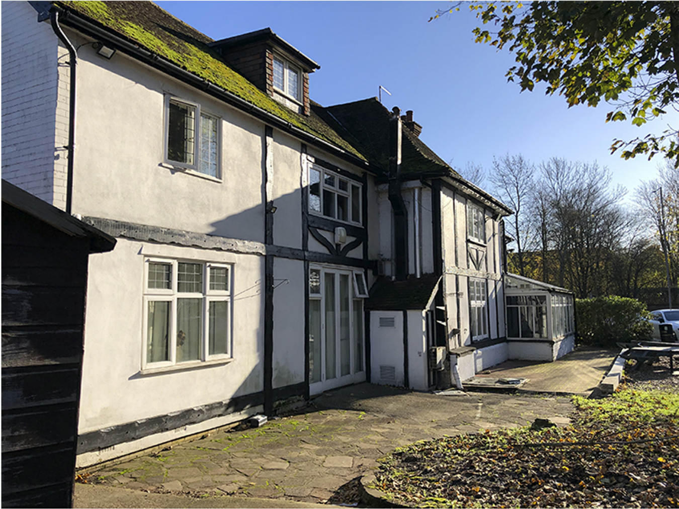
PHOTO 3 : VIEW OF EXISTING HOTEL BUILDING 1 / TUDOR SUITE + CONSERVATORY