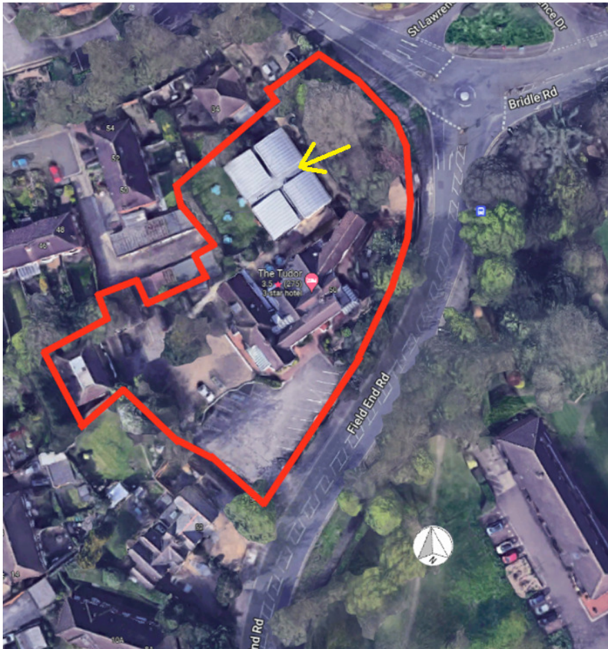
Fig 1: Aerial site plan (Yellow arrow - Building 2)

The Tudor lodge hotel consisted of several buildings with Hotel building 1 being a Grade II listed buildings and building 2 with modern design. The site is located at the junction of Field End Rd and Bridle Rd.