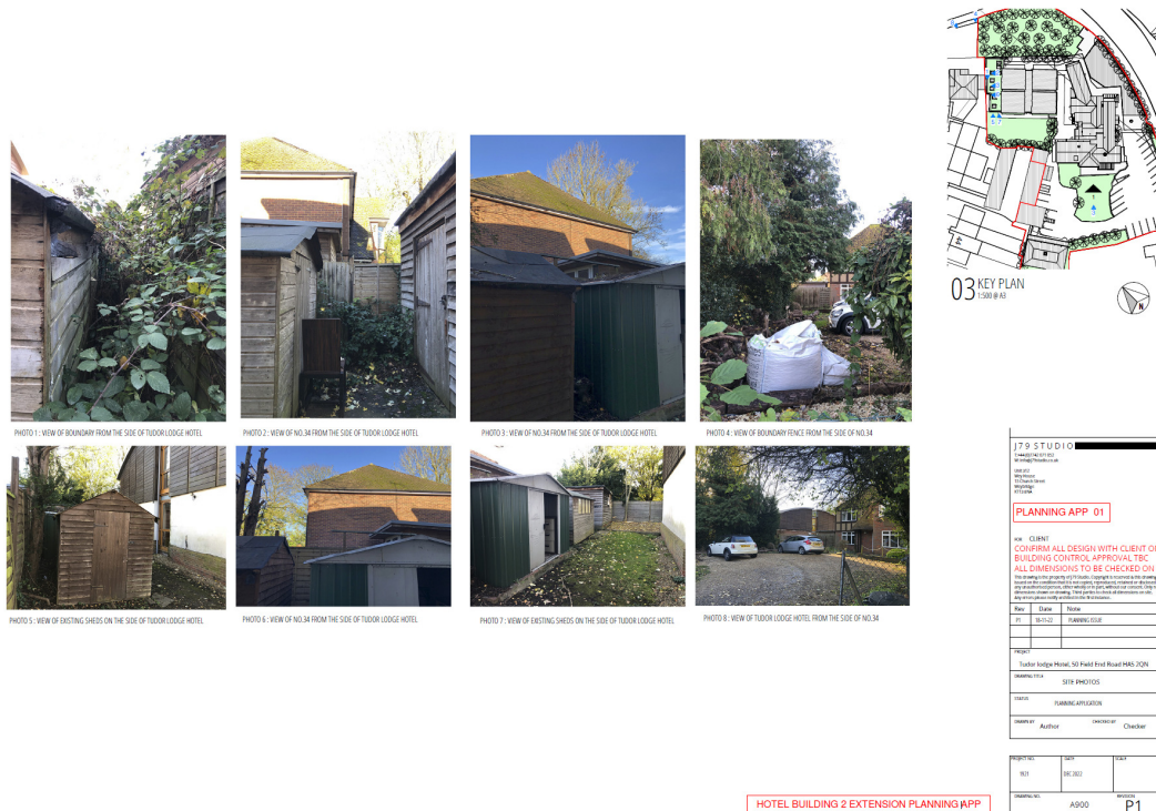
Fig 2: existing site photos of hotel building 2