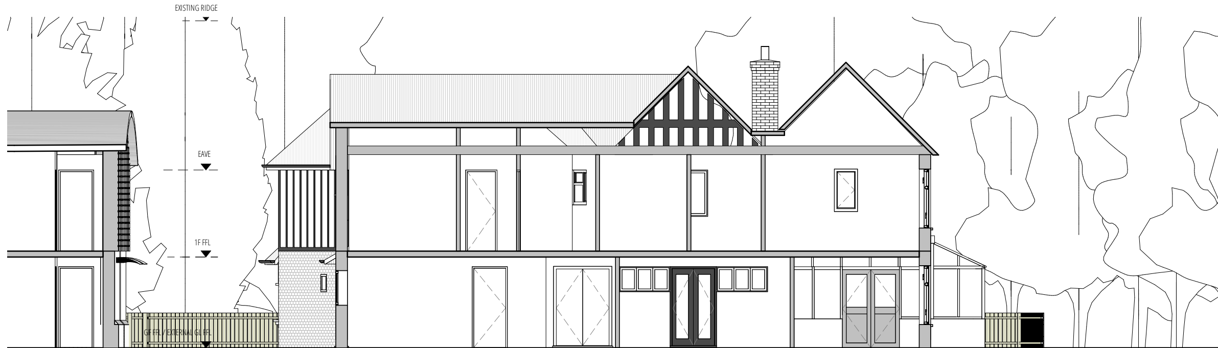
01 EXISTING SECTION AA 1:100 @ A3