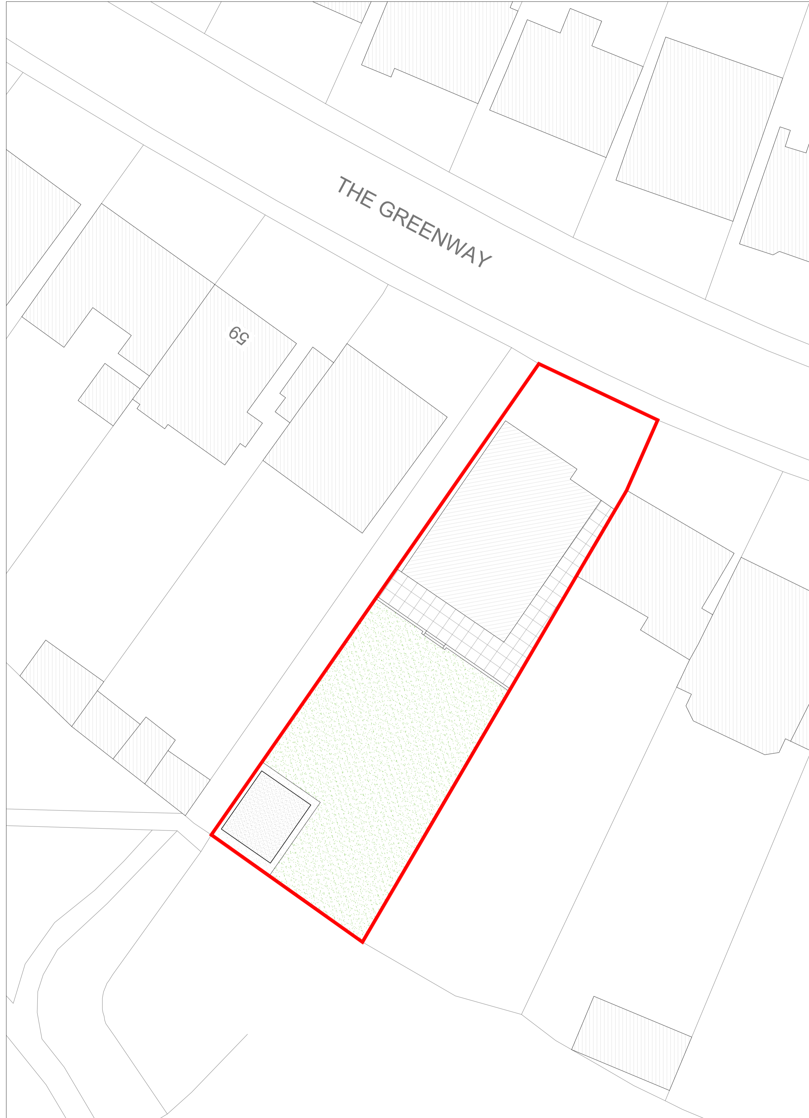
EXISTING BLOCK PLAN SCALE 1:200