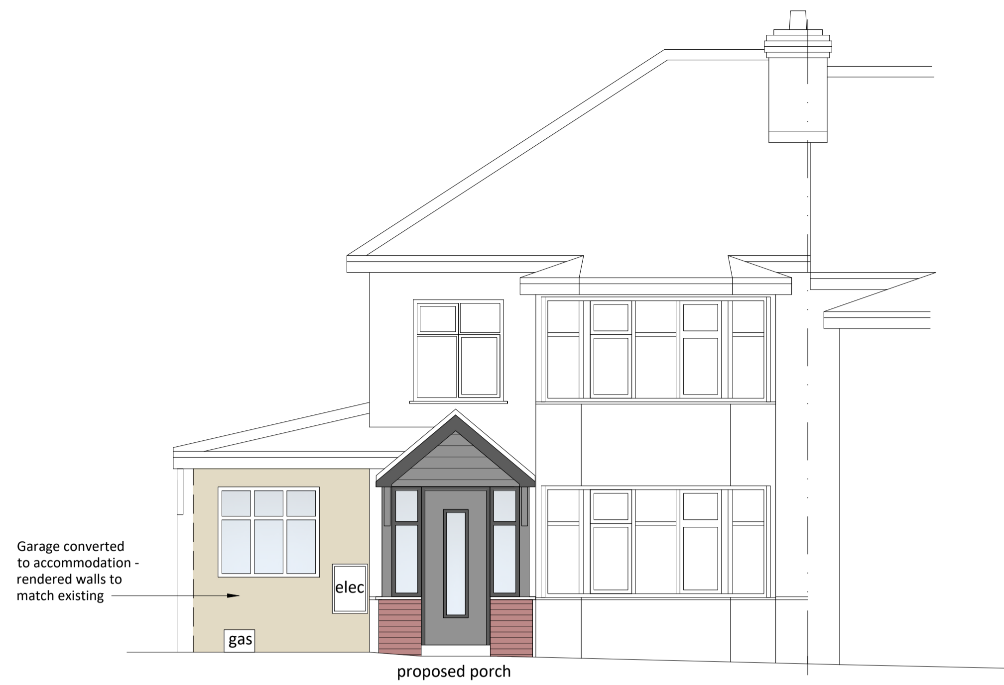
FRONT ELEVATION - PROPOSED