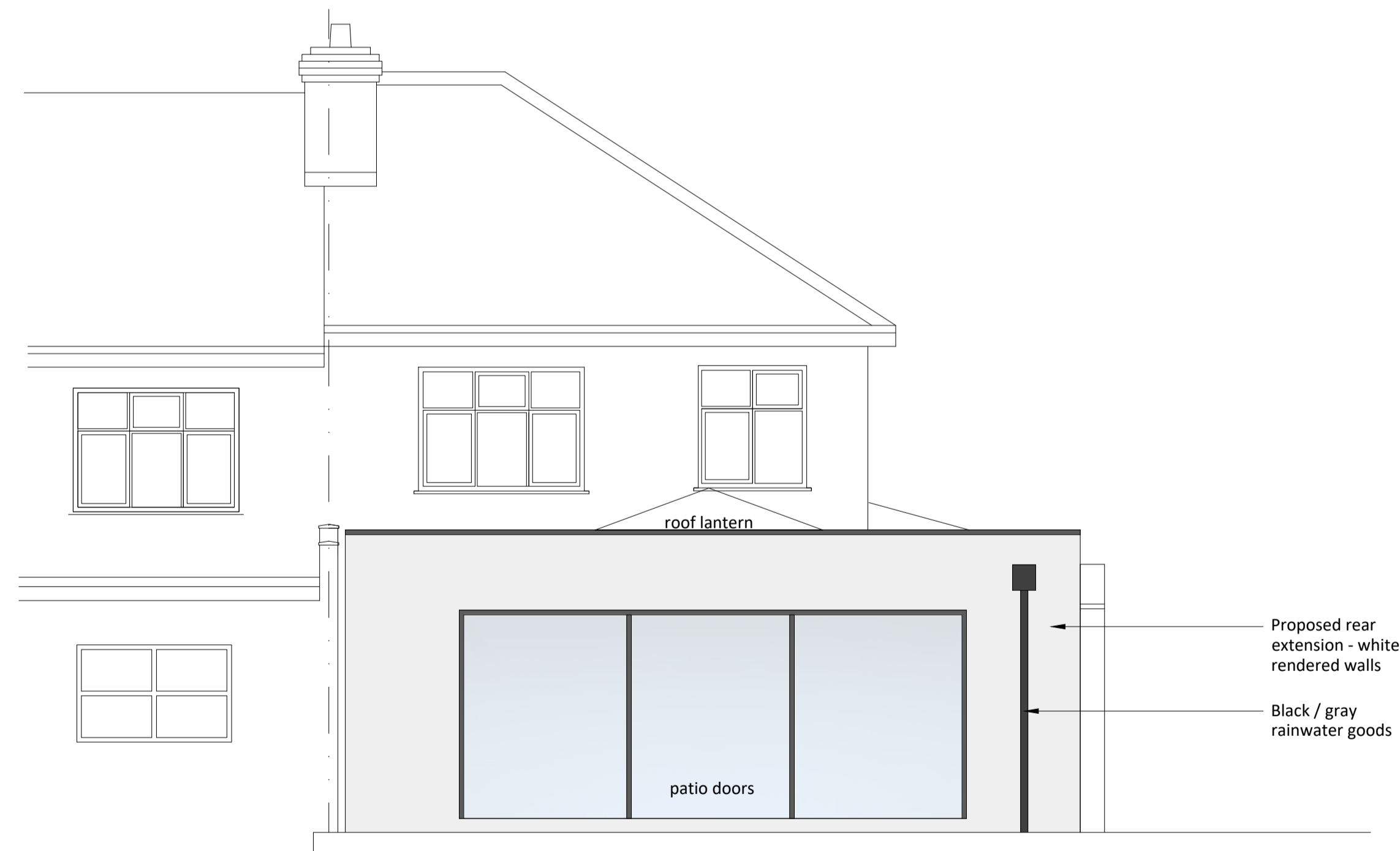
REAR ELEVATION - PROPOSED