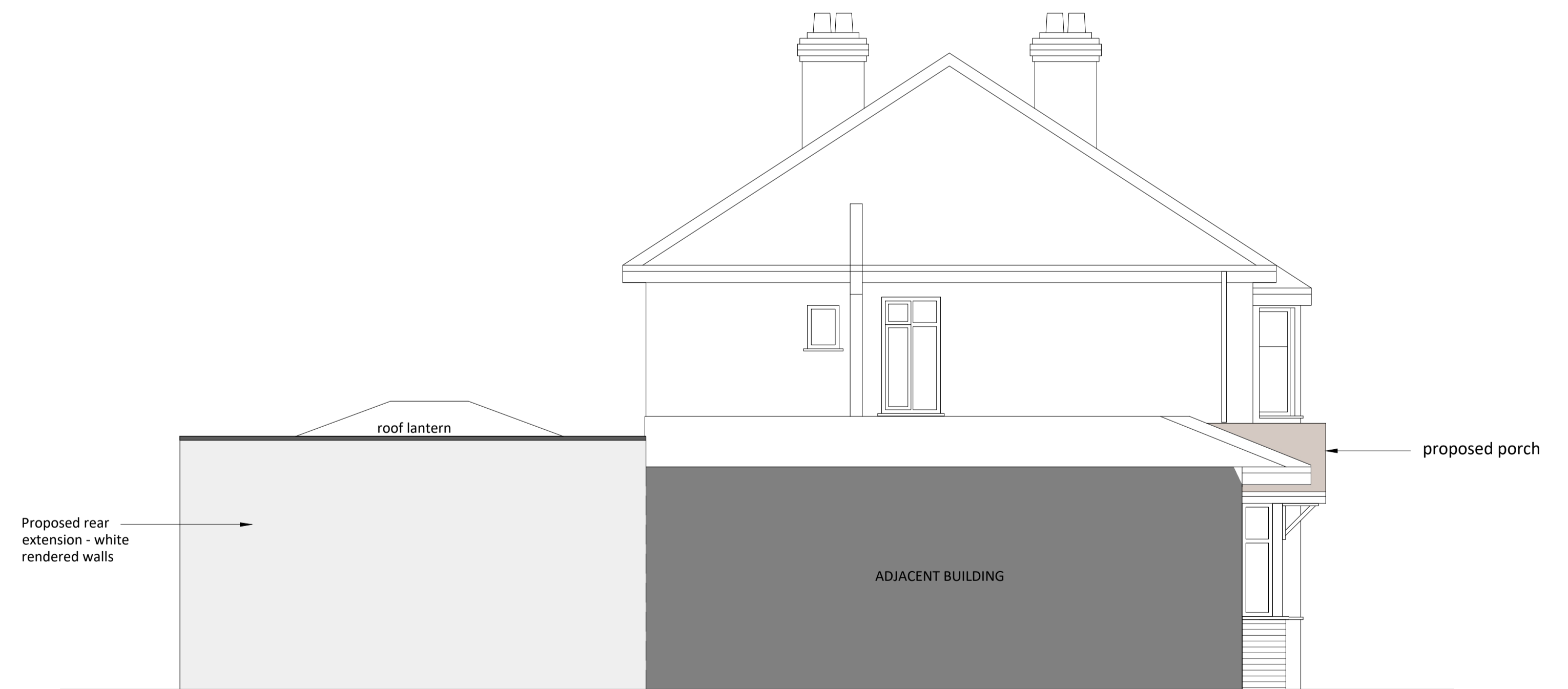
SIDE ELEVATION - PROPOSED