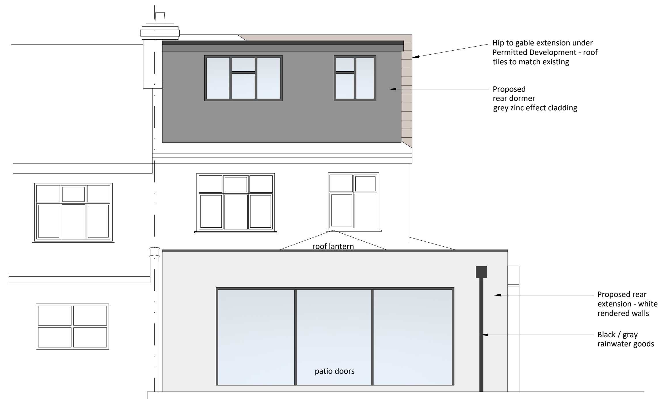
REAR ELEVATION - EXISTING