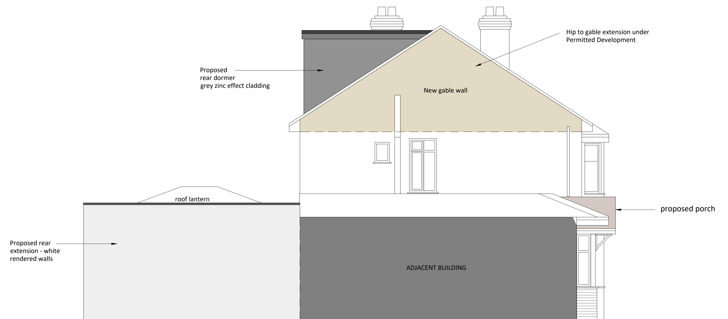
SIDE ELEVATION - PROPOSED