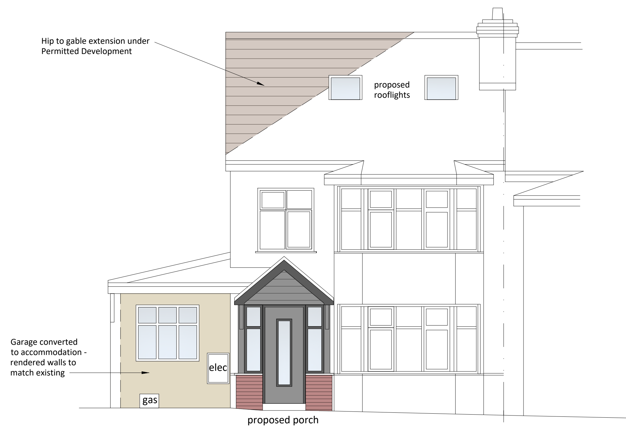
FRONT ELEVATION - PROPOSED