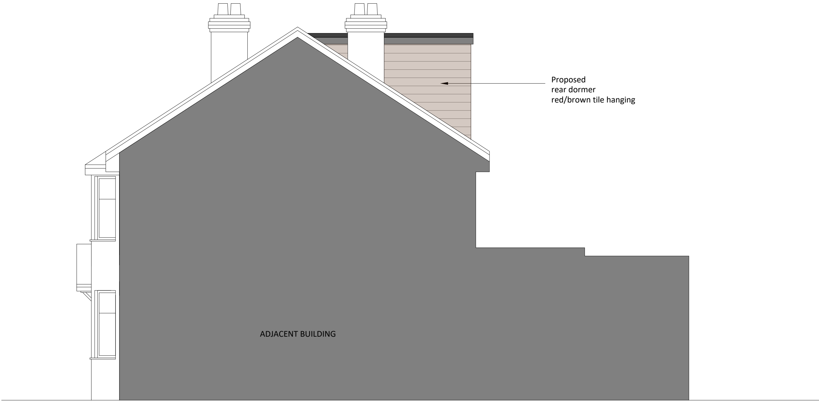
SIDE ELEVATION - PROPOSED

Proposed rear dormer red/brown tile hanging