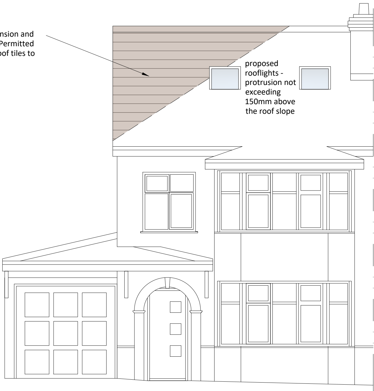
FRONT ELEVATION - PROPOSED

Hip to gable extension and rooflights under Permitted Development - roof tiles to match existing