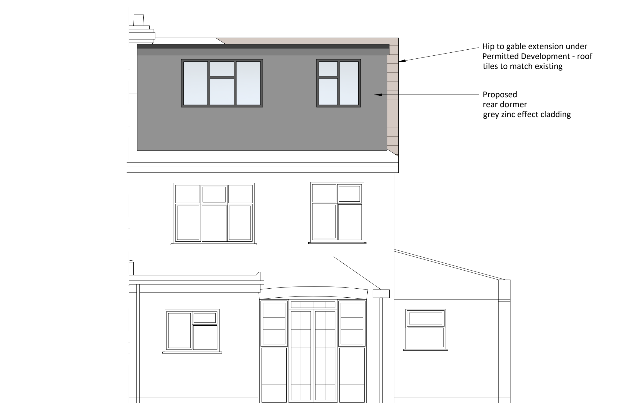
REAR ELEVATION - EXISTING