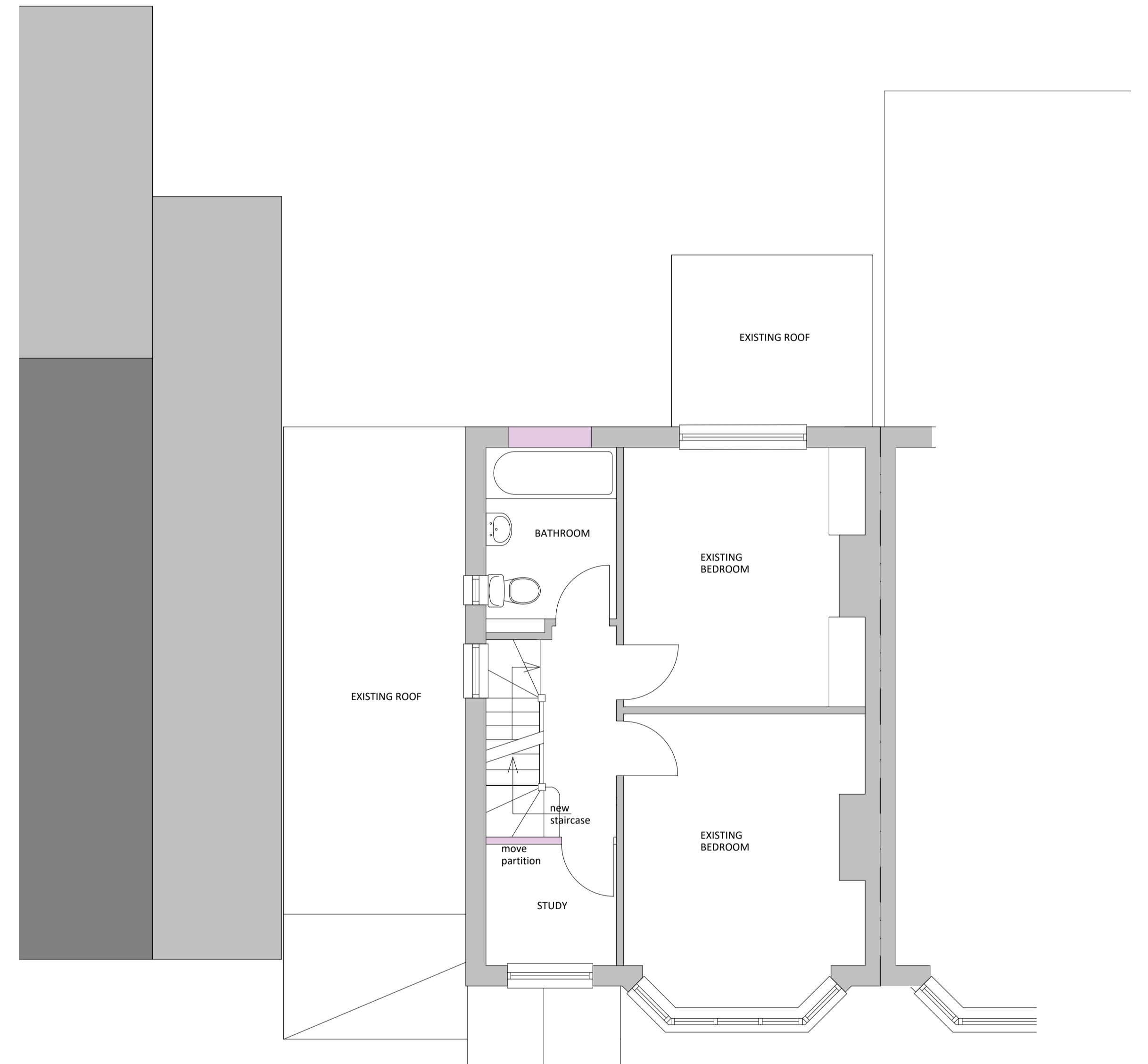
FIRST FLOOR PLAN - PROPOSED