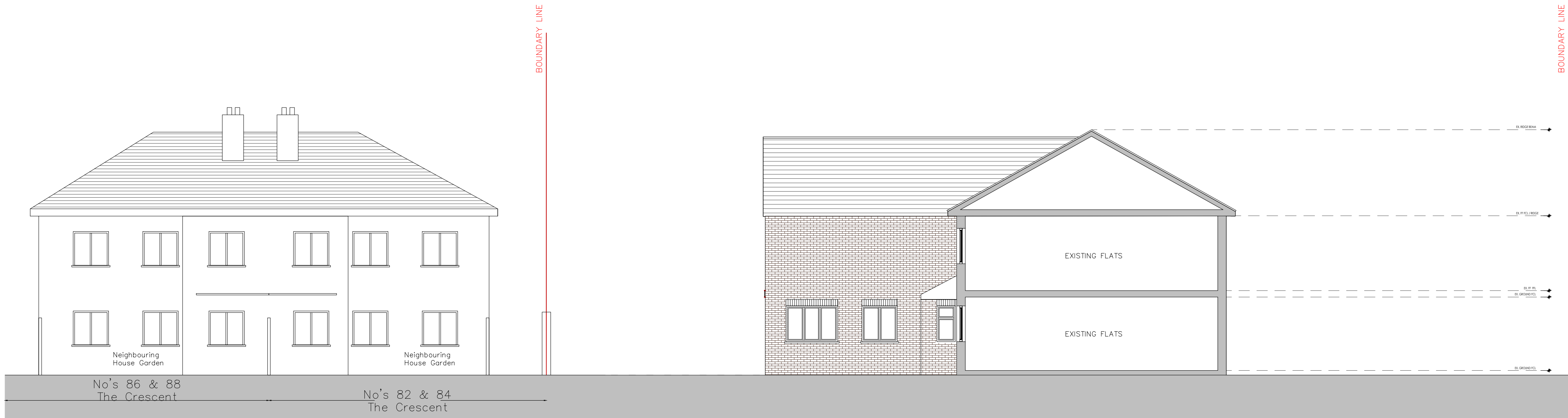
1 Existing Section AA