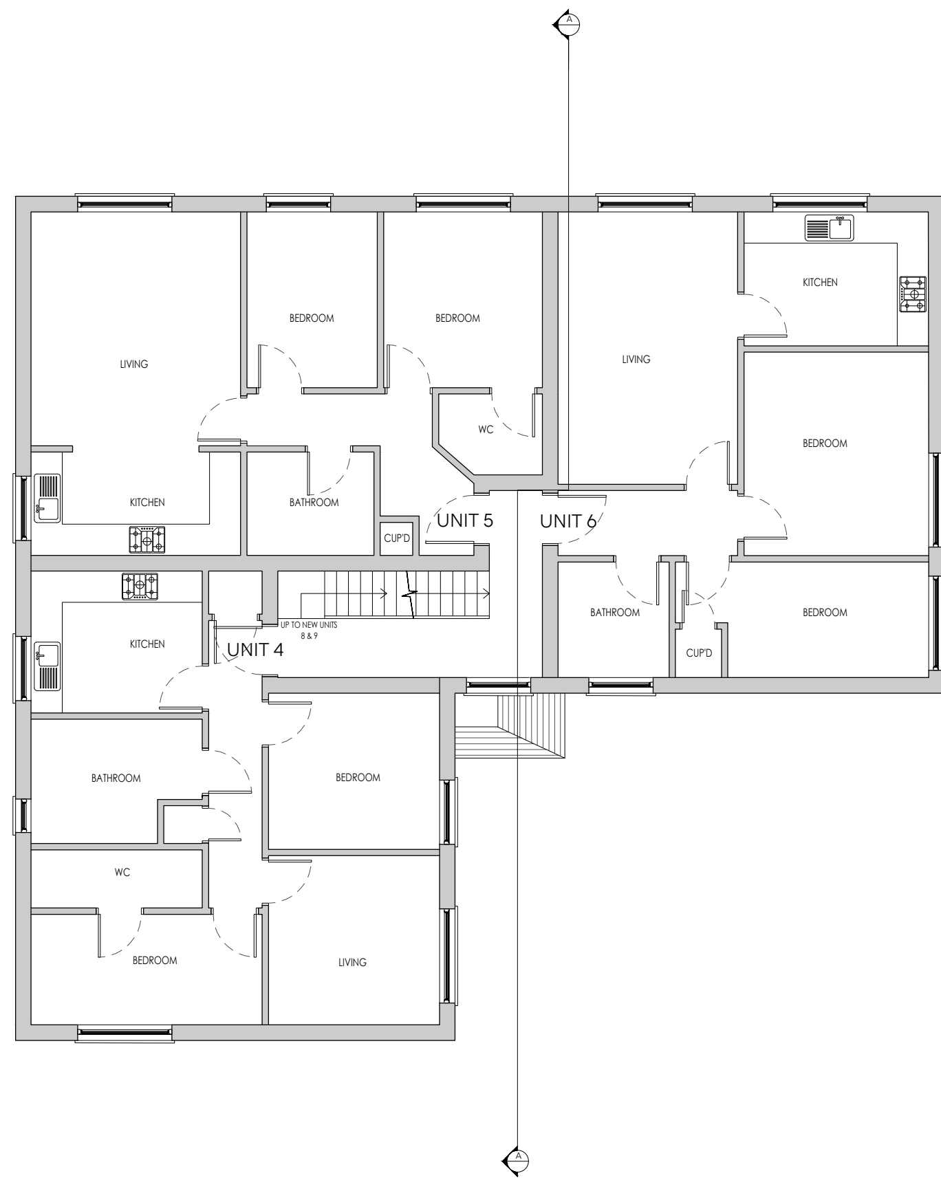
2 Proposed First Floor Plan Scale 1:100