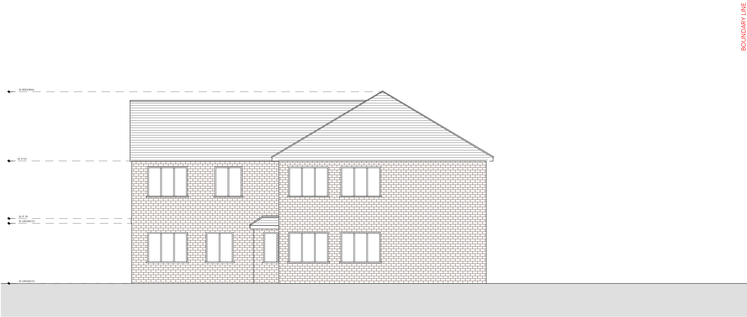
4 Existing North Elevation Scale 1:100