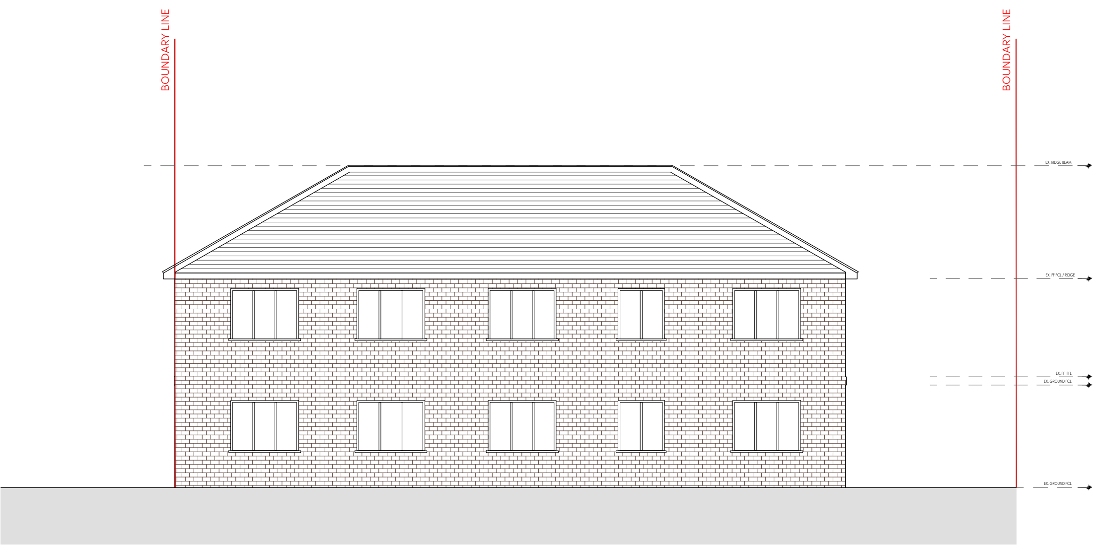
2 Existing West Elevation Scale 1:100