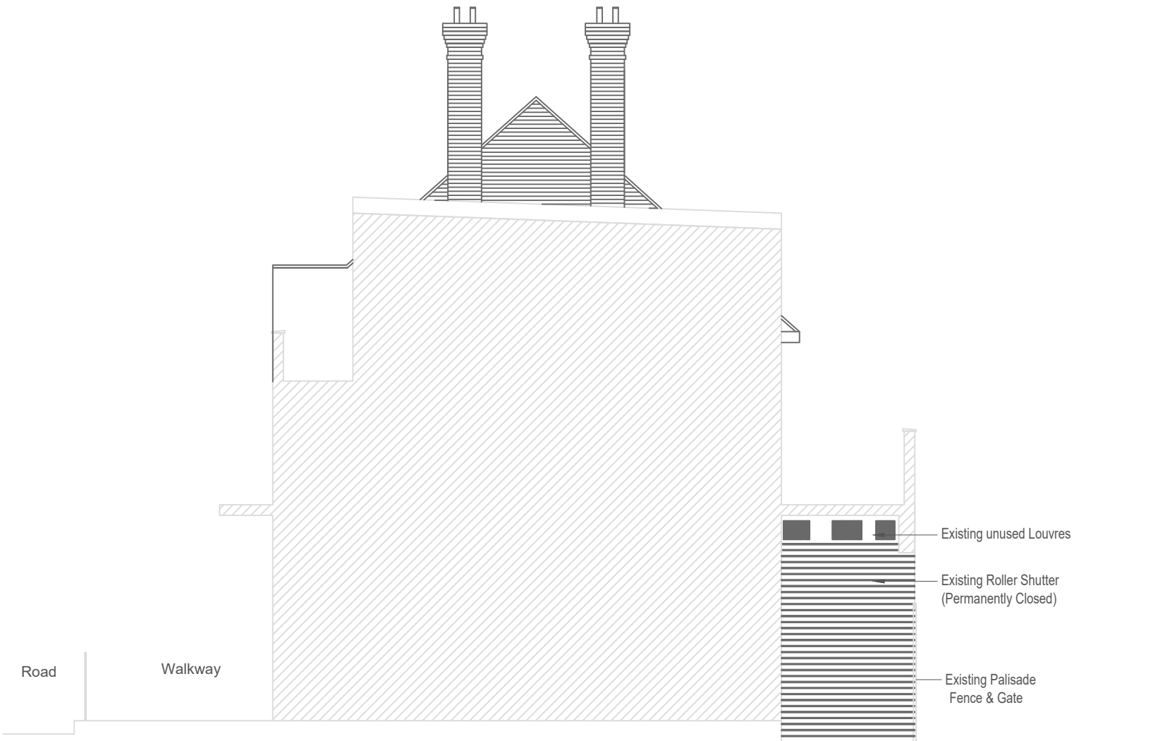
EXISTING SIDE ELEVATION (WEST) SIDE 1