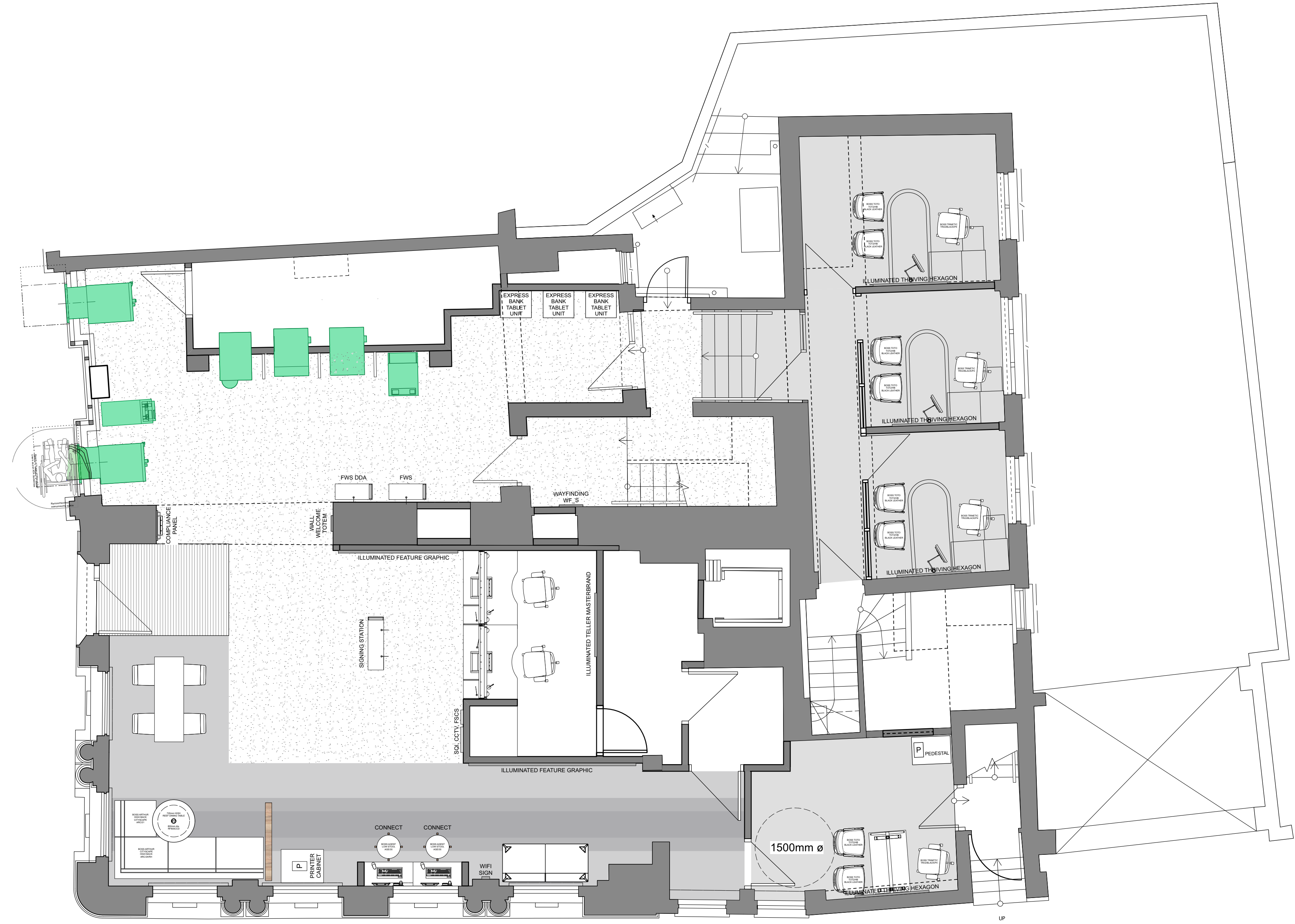
01 Branch Layout 1:100@A3