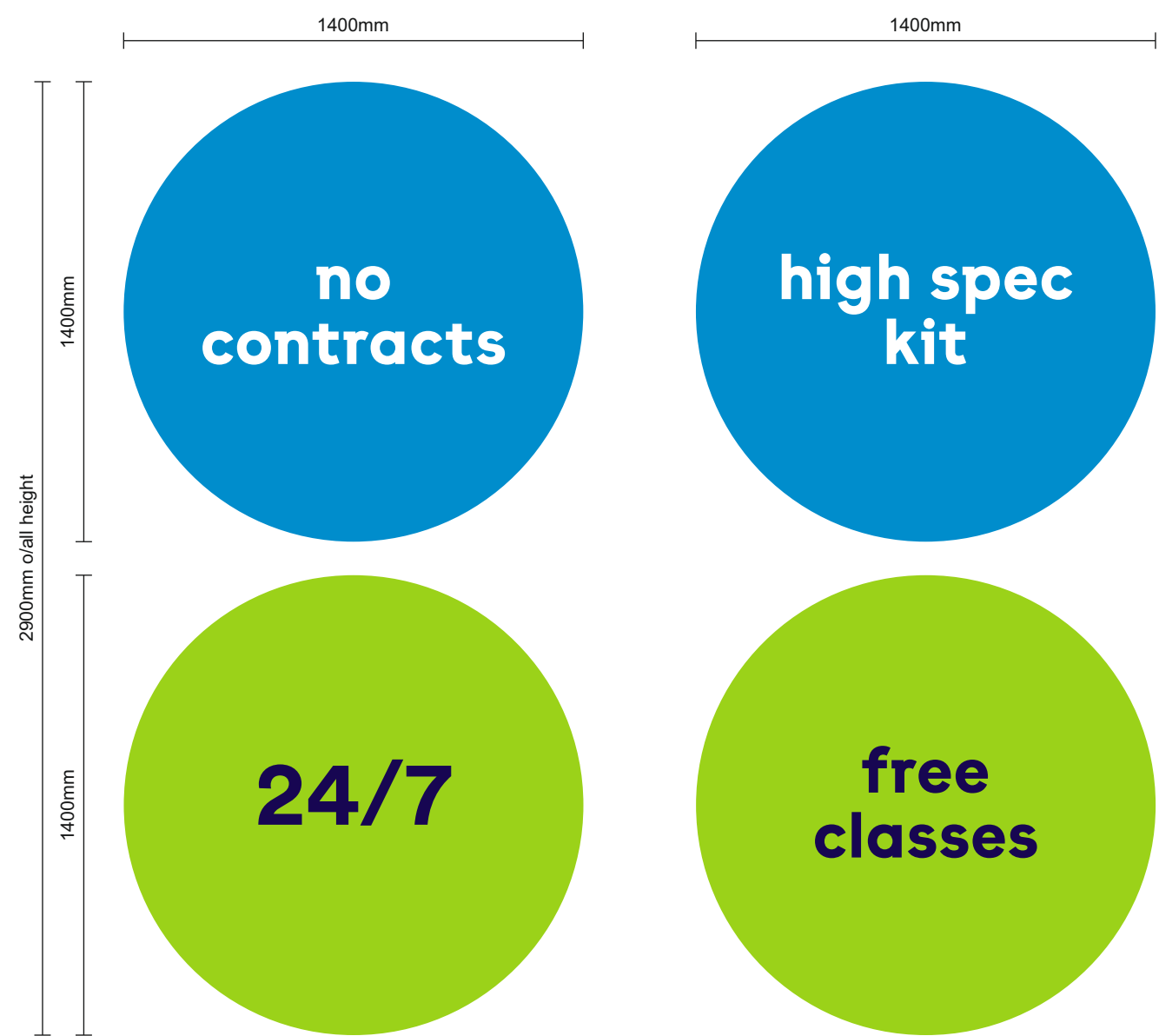
4-OFF USPs Fret cut ACM panels with printed graphics to face.