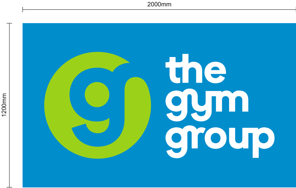
1-OFF Folded stencil cut aluminium fascia internally illuminated.