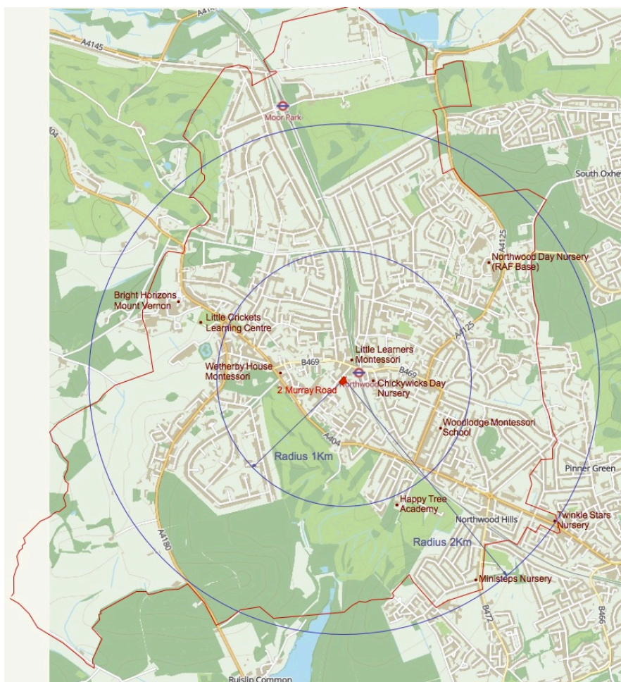
Map of the HA6 postcode area with 2 Murray Road at the centre

Generally childcare provision needs to be very local, usually within walking distance of families' homes and is ideally en route to other facilities, whether shops or transport for travelling to work etc. The following analysis therefore addresses the HA6 postcode area, which the proposed site of the former Northwood Police Station, at 2 Murray Road, HA6 2YN sits at the centre of.