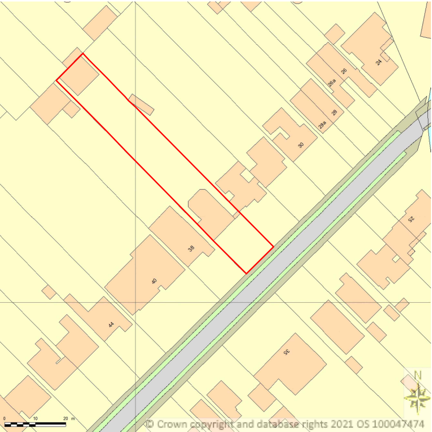
Location Plan @1:1250