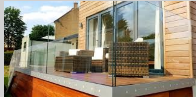
FRAMELESS GLASS BALUSTRADE