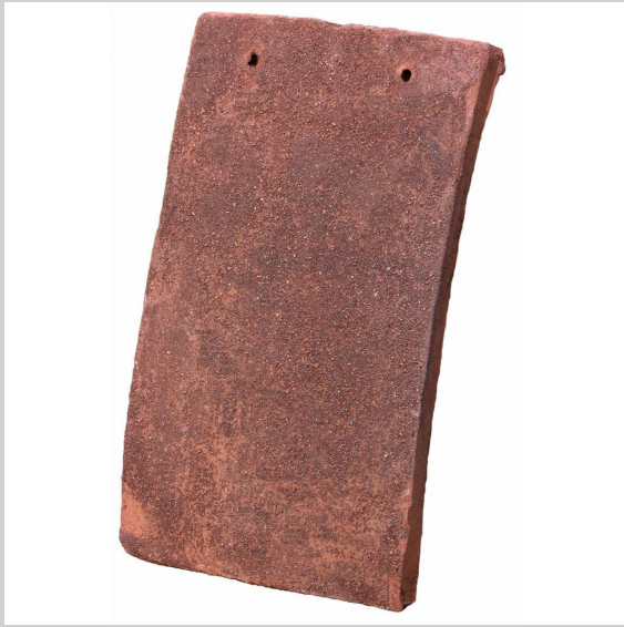
CLAY PLAIN TILE (MEDIUM ANTIQUE)