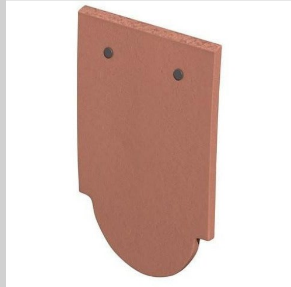
CLAY ORNAMENTAL TILE (MEDIUM ANTIQUE)