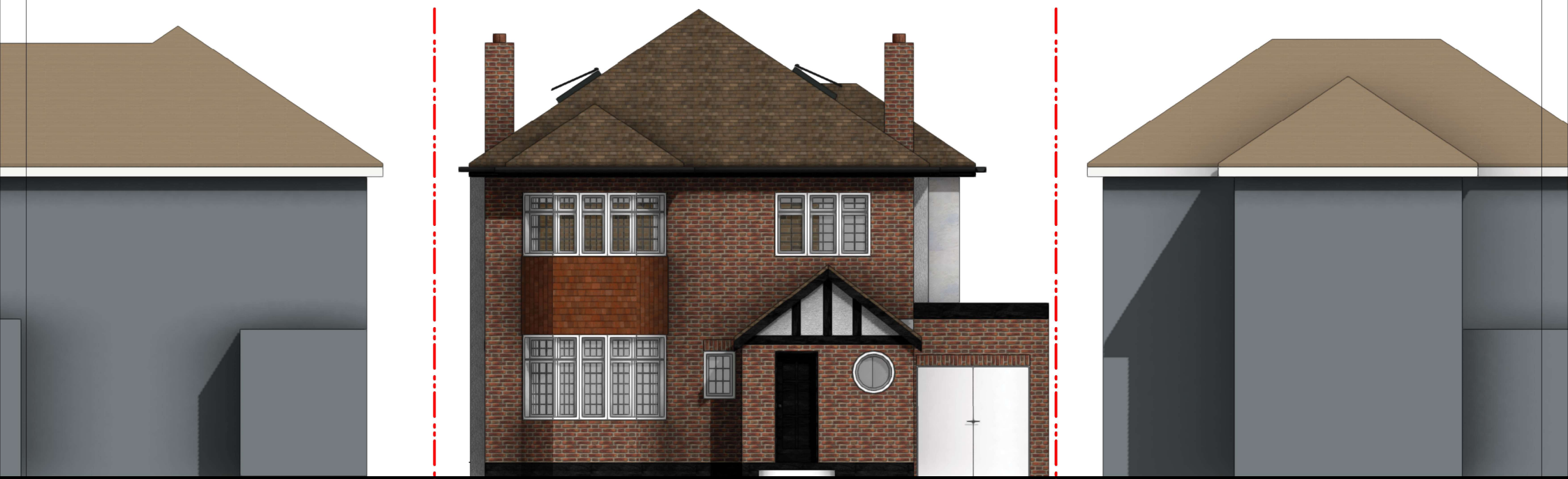
01 01 PROP ELEV Front Scale: 1:100

GENERAL - New materials used in exterior work to match existing.