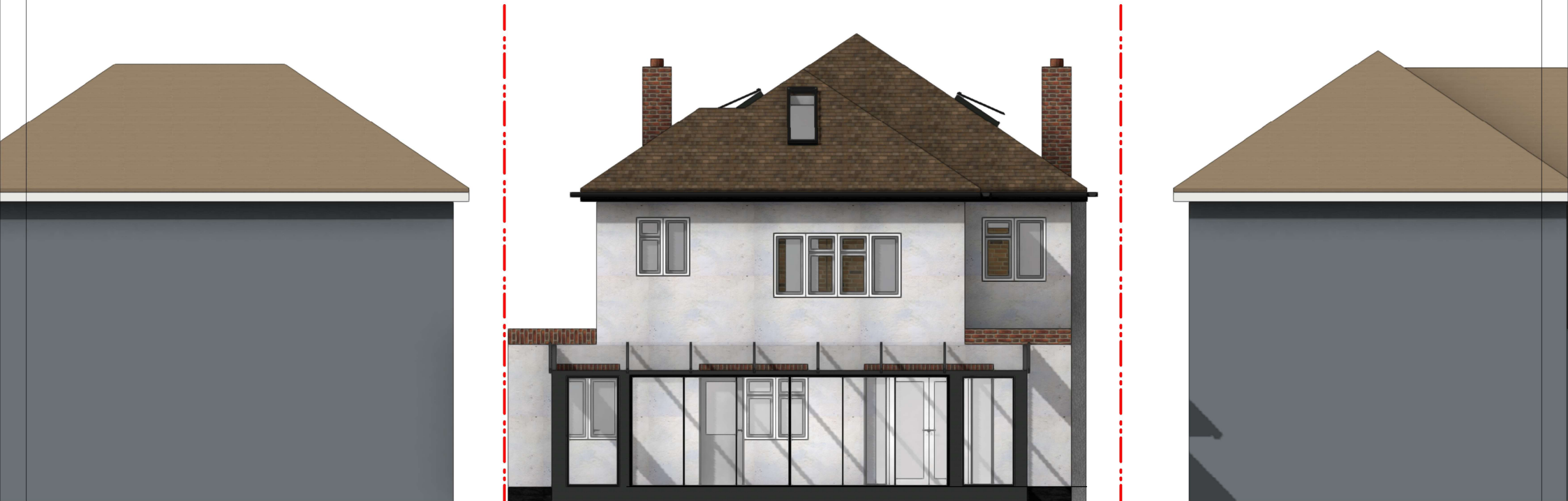
02 02 PROP ELEV REAR Scale: 1:100