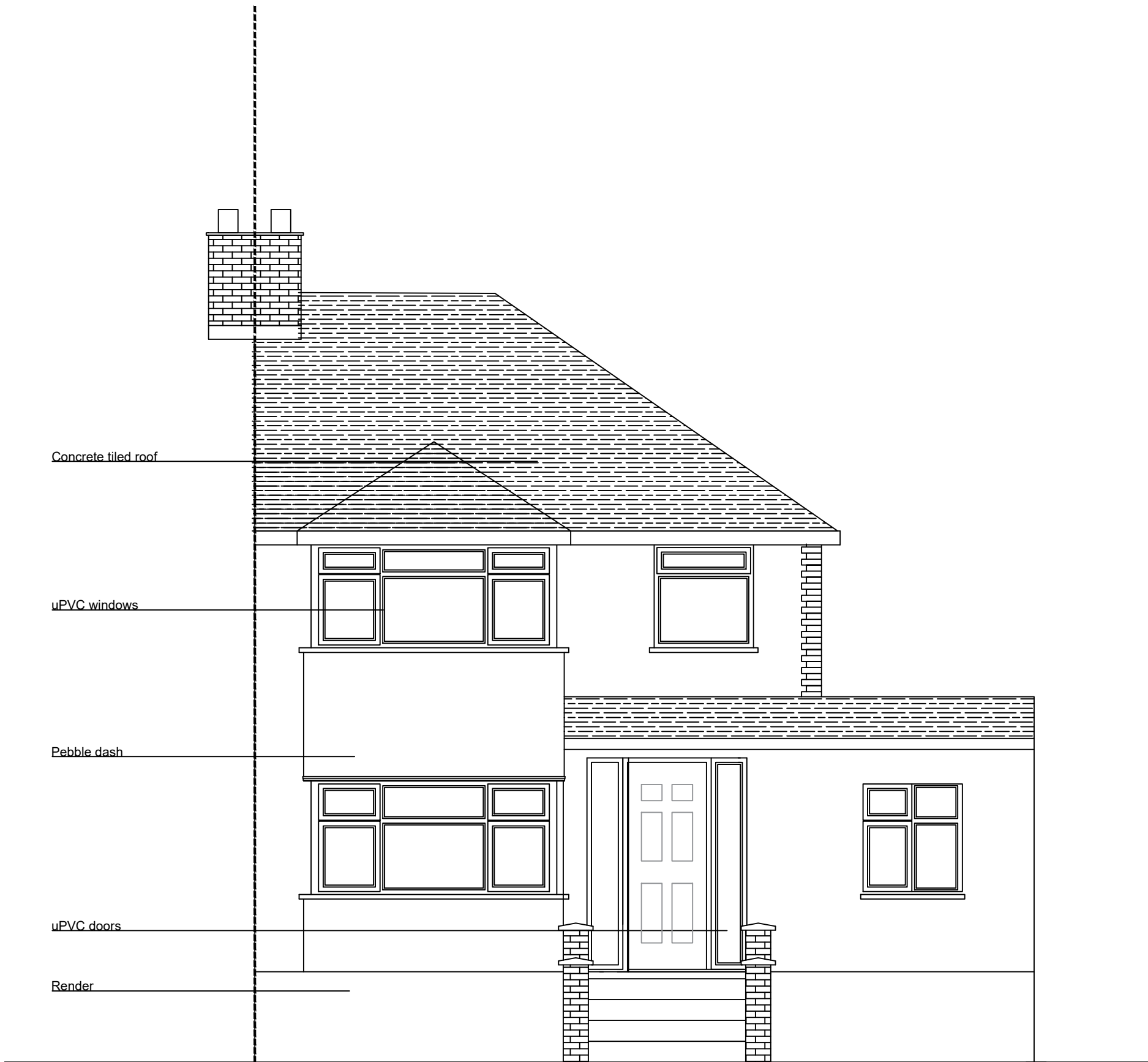
ELEVATION A PROPOSED FRONT ELEVATION