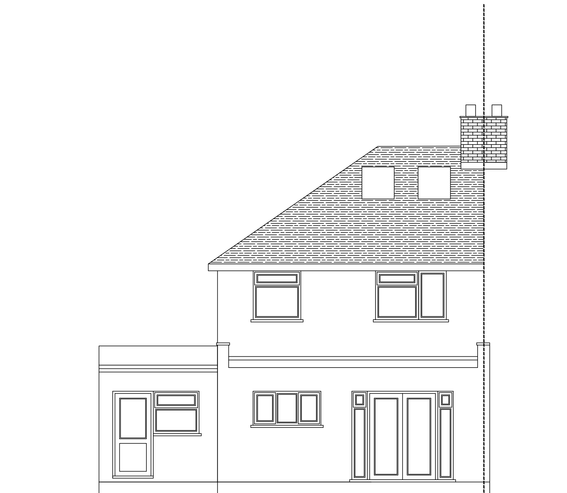
ELEVATION C PROPOSED REAR ELEVATION