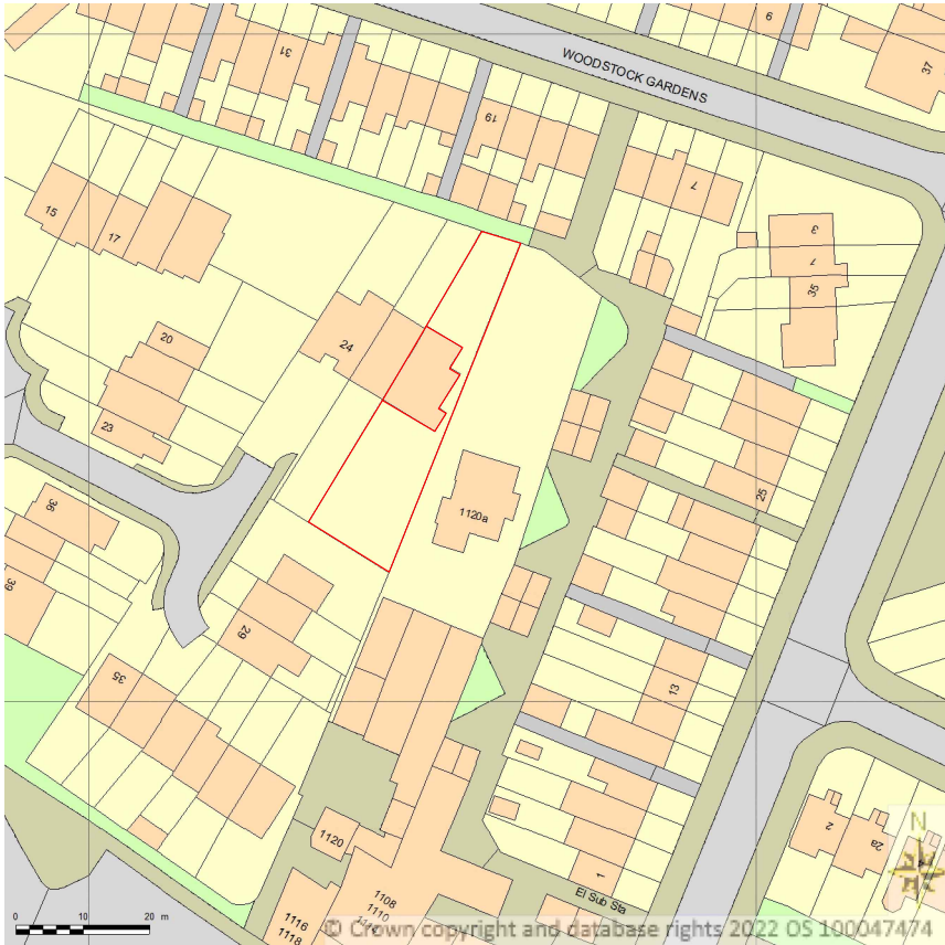
Location Plan @ 1:1250