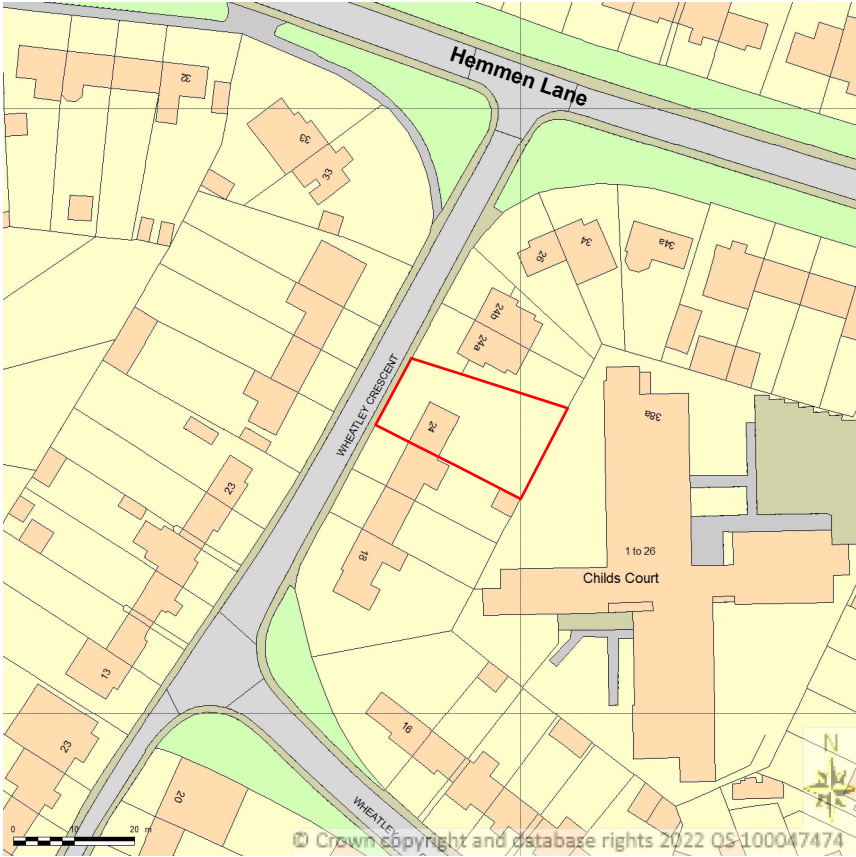
Location Plan@ 1:1250