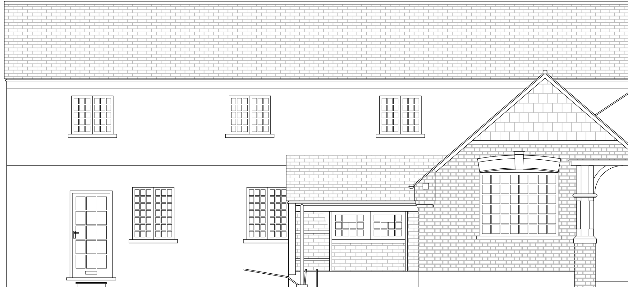
EAST ELEVATION SCALE 1:50

Drawing number CBC-1868052-03 Revision 00