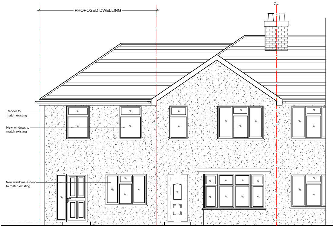
01 - FRONT ELEVATION