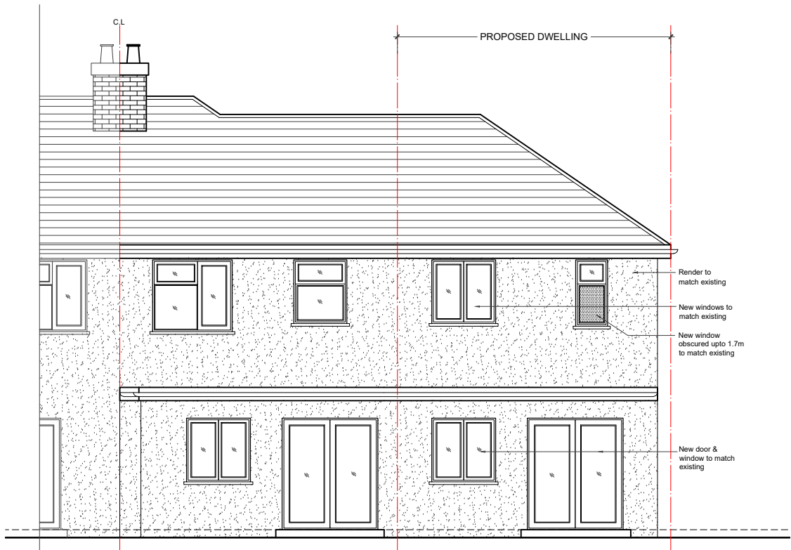
03 - REAR ELEVATION