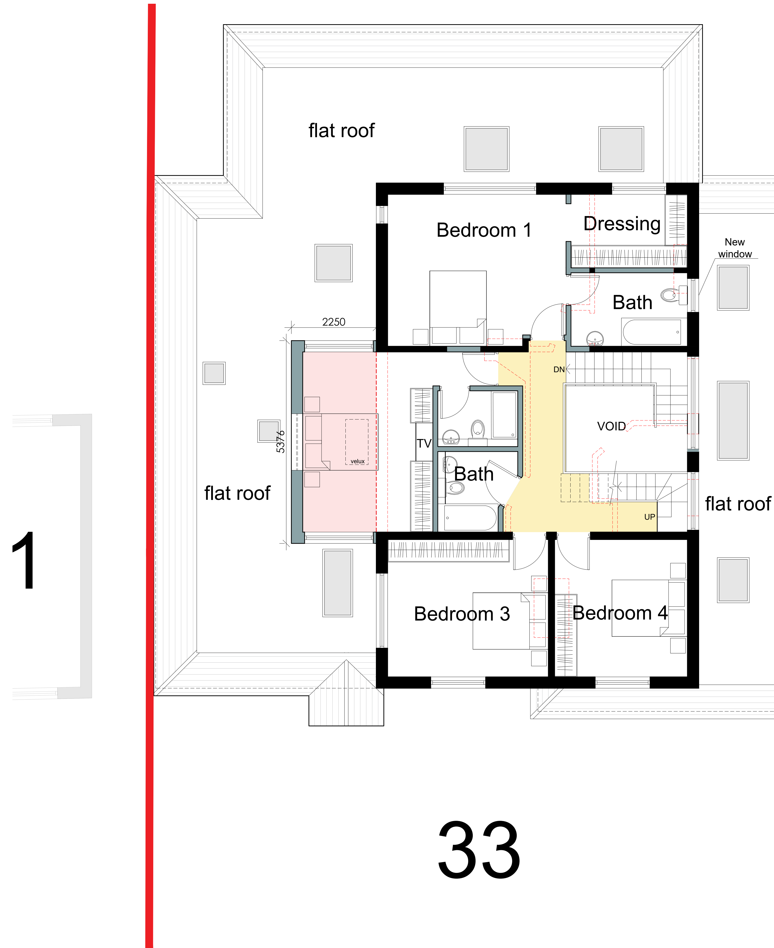
PROPOSED FIRST FLOOR