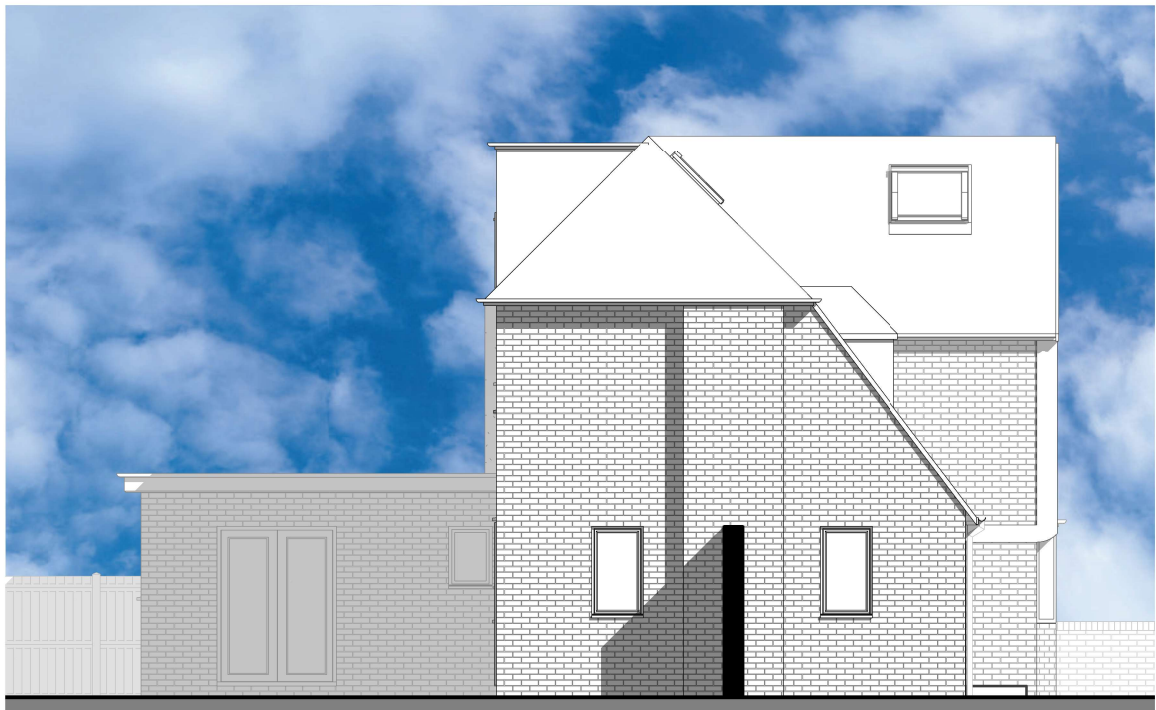
Existing Side Elevation 1