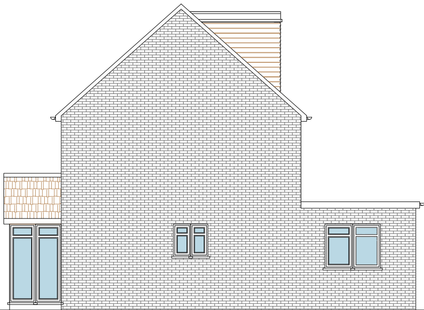
PROPOSED SIDE (1) ELEVATION