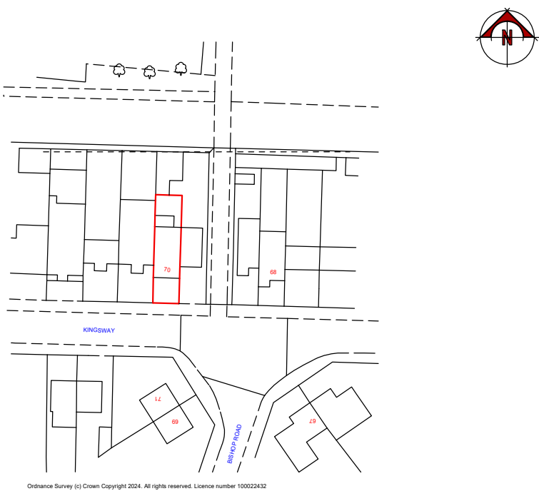
1:1250 LOCATION PLAN