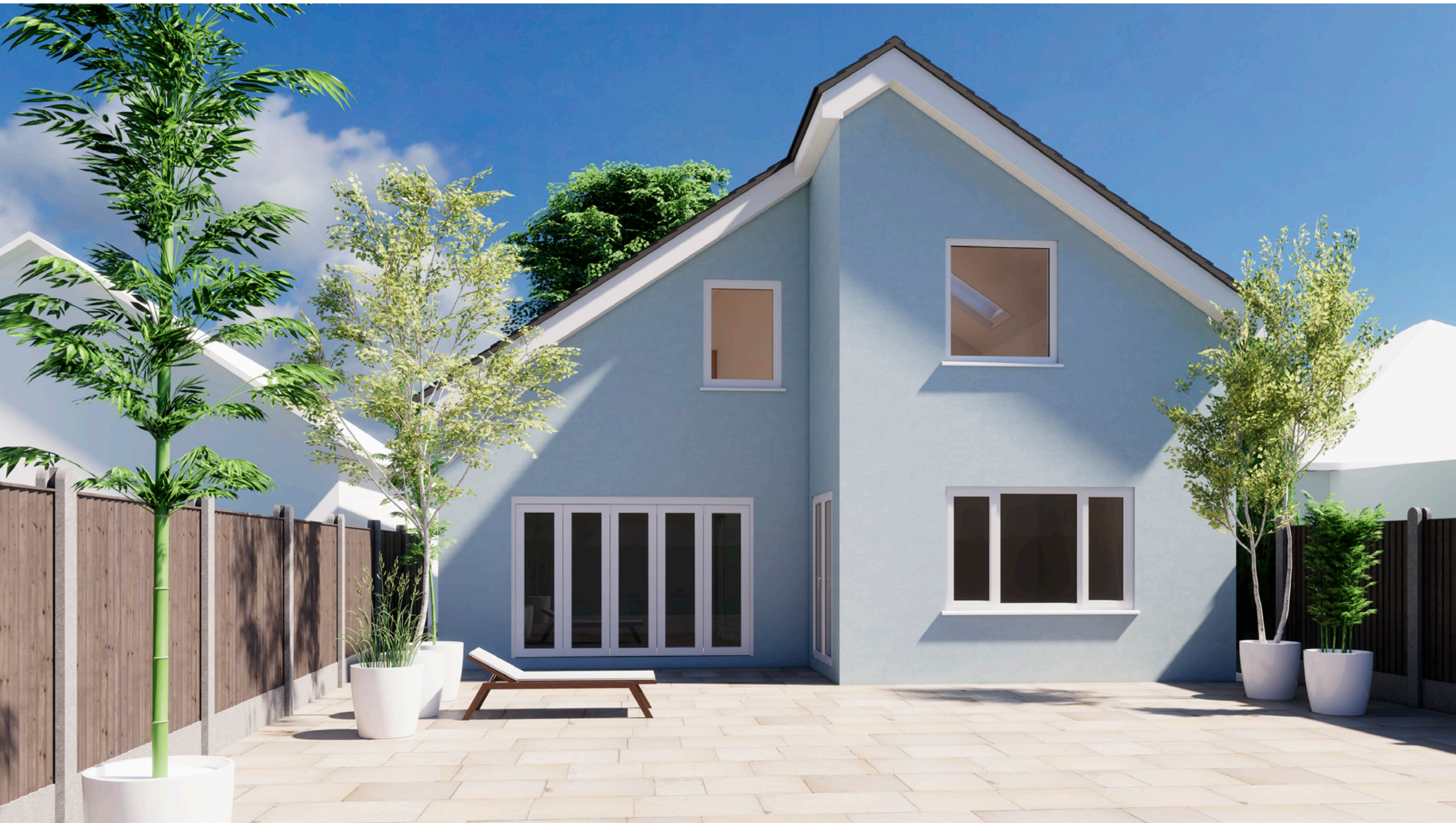
Focal Length: 28 mm