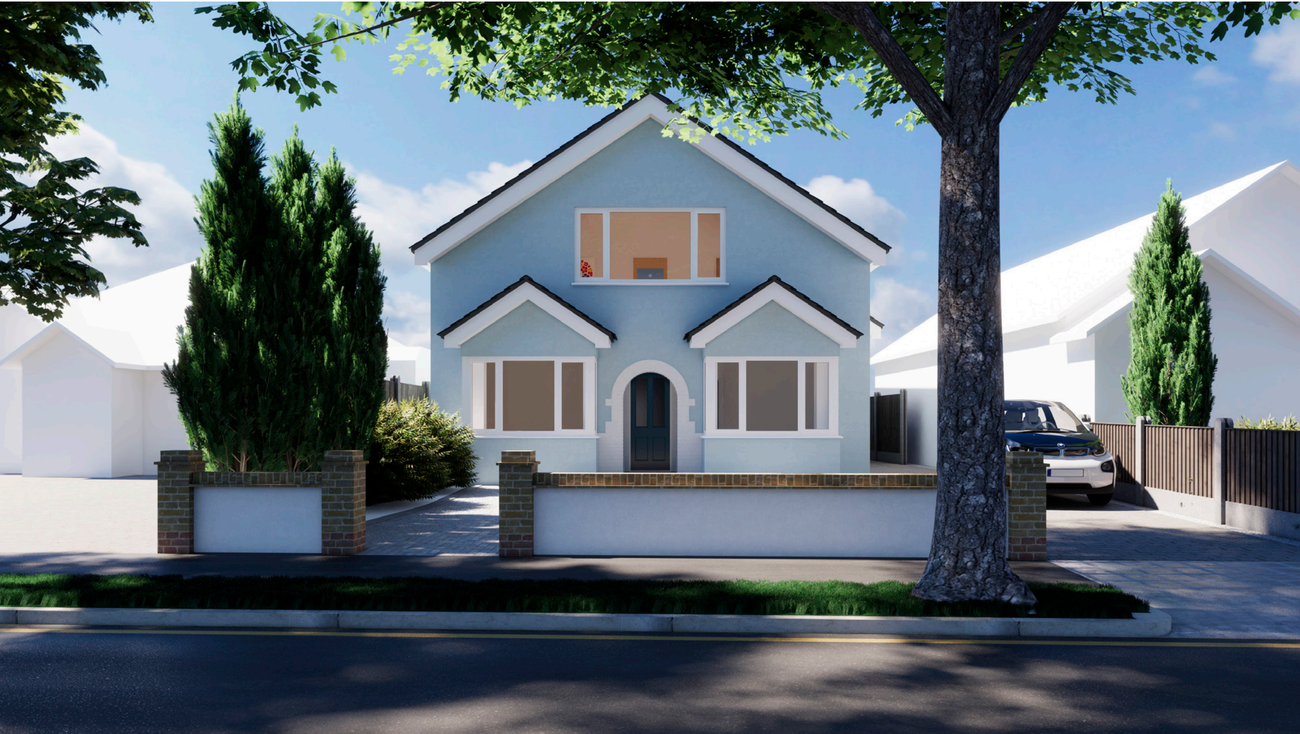
Focal Length: 25 mm