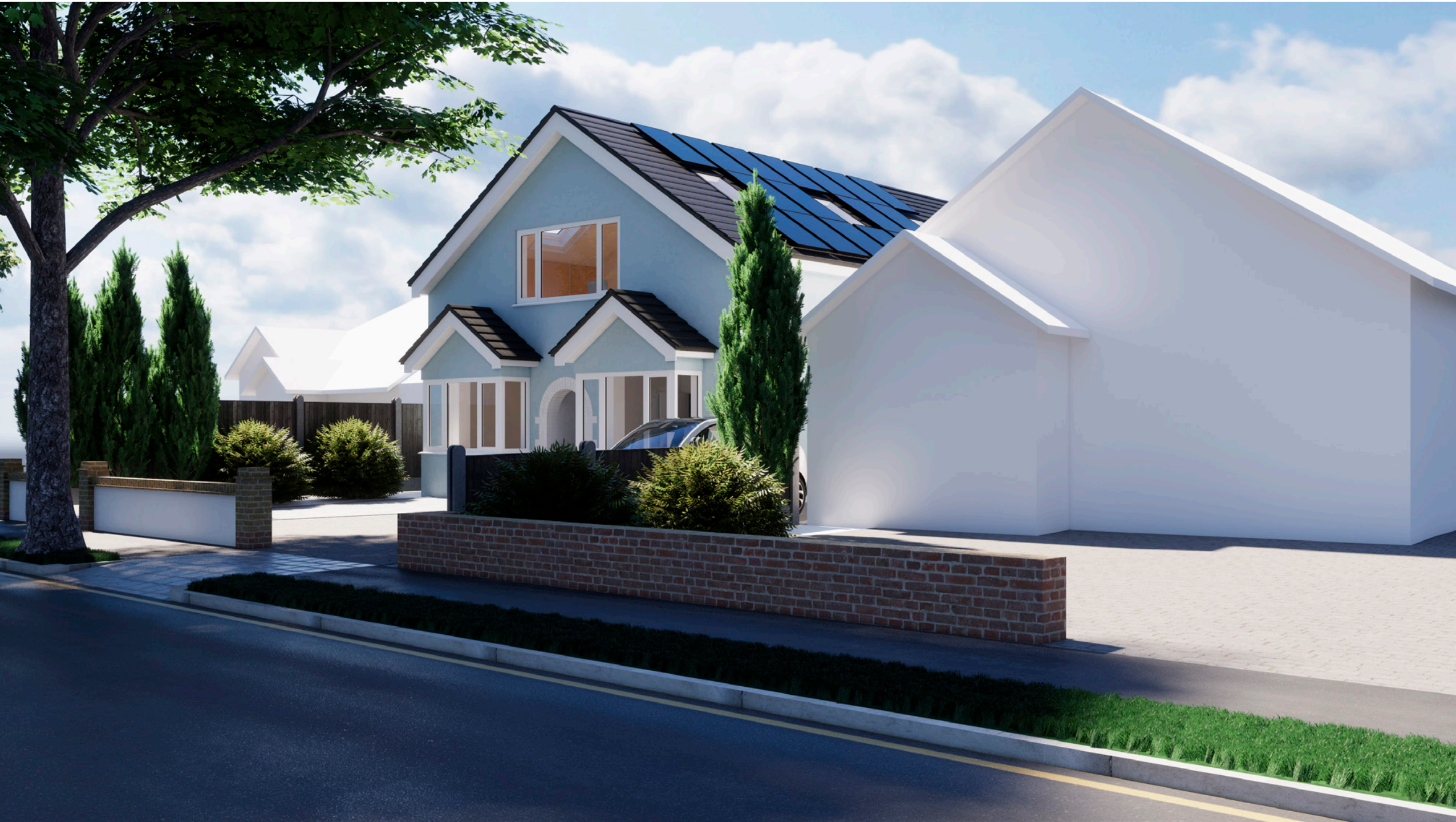
Focal Length: 34 mm