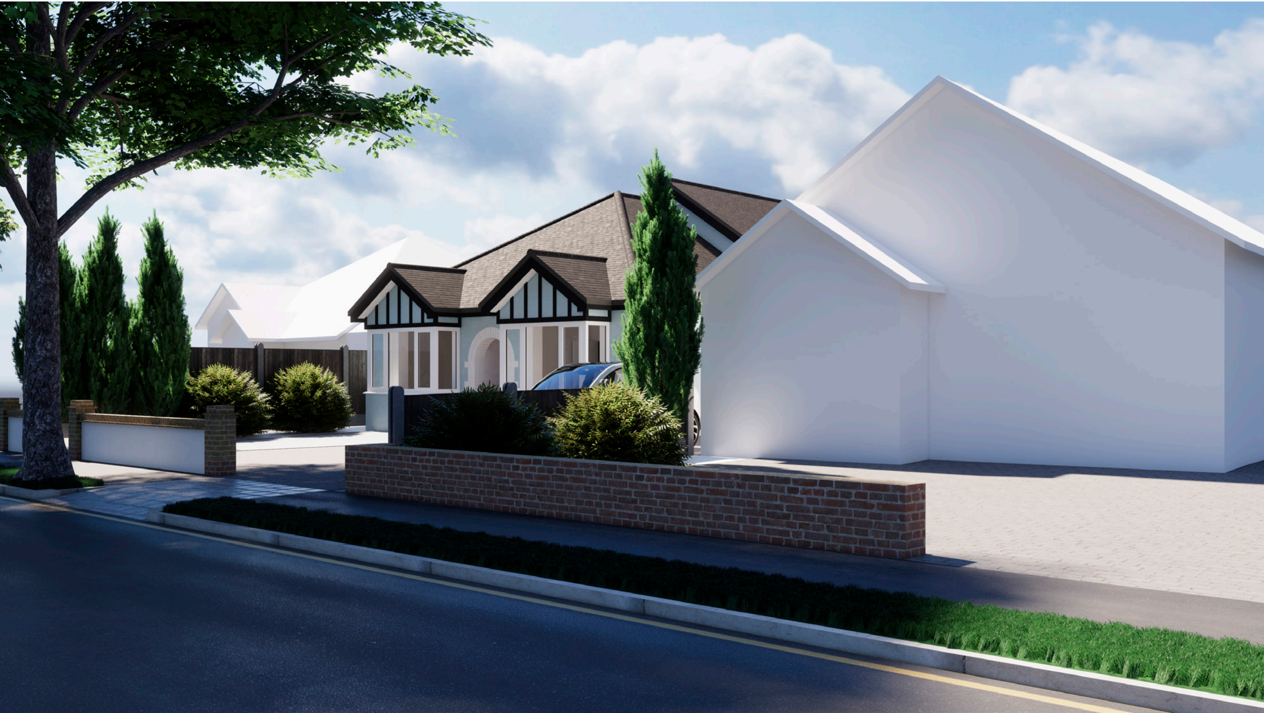
Focal Length: 34 mm