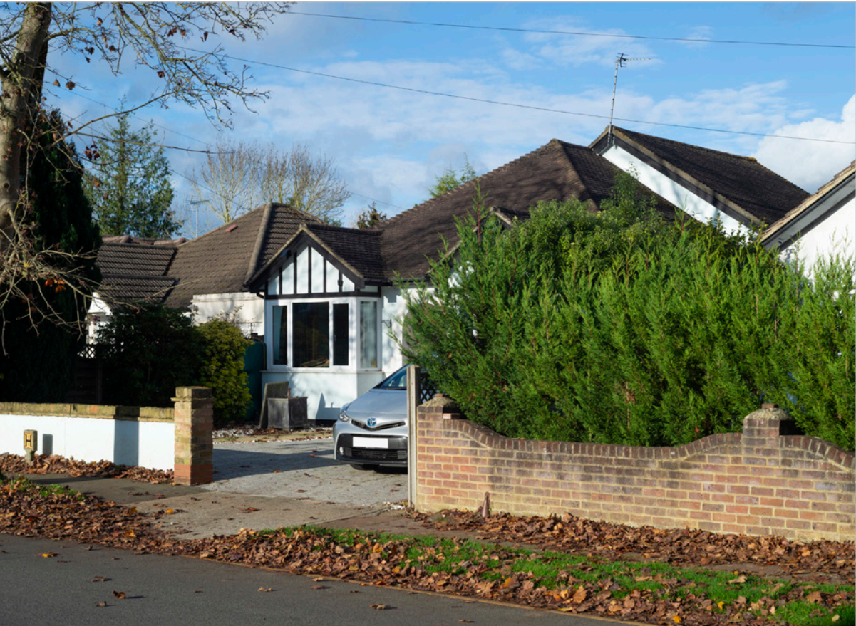
Focal Length: 50 mm