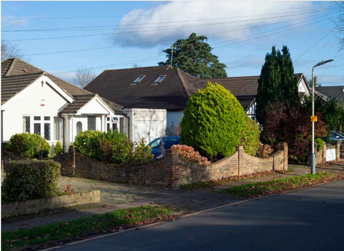
Focal Length: 50 mm