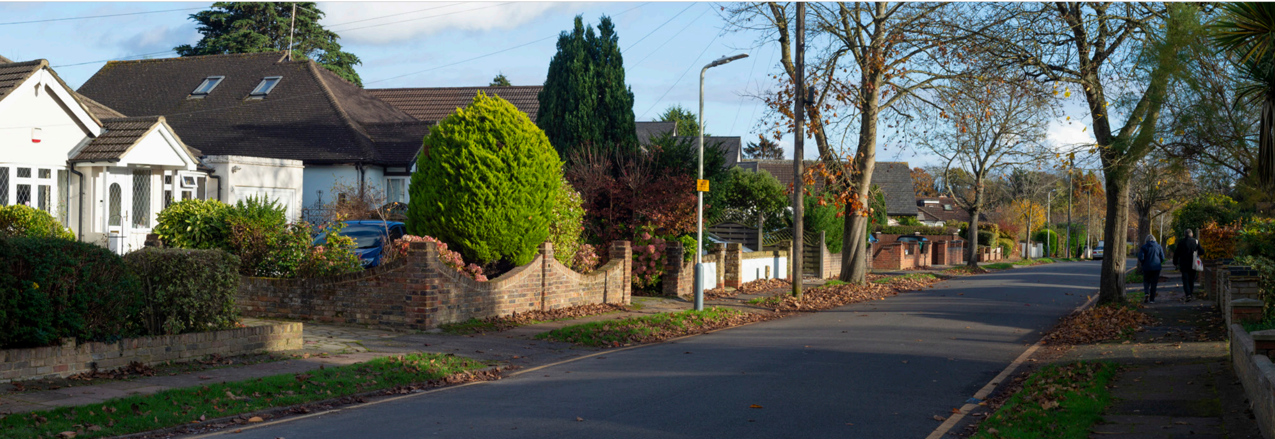
Focal Length: 30 mm