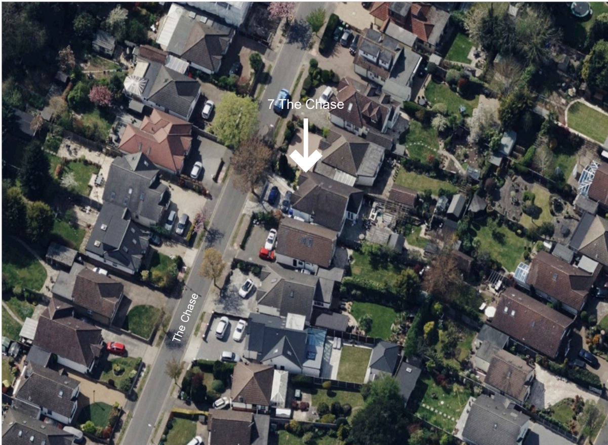
_____ Aerial Photo From East 2