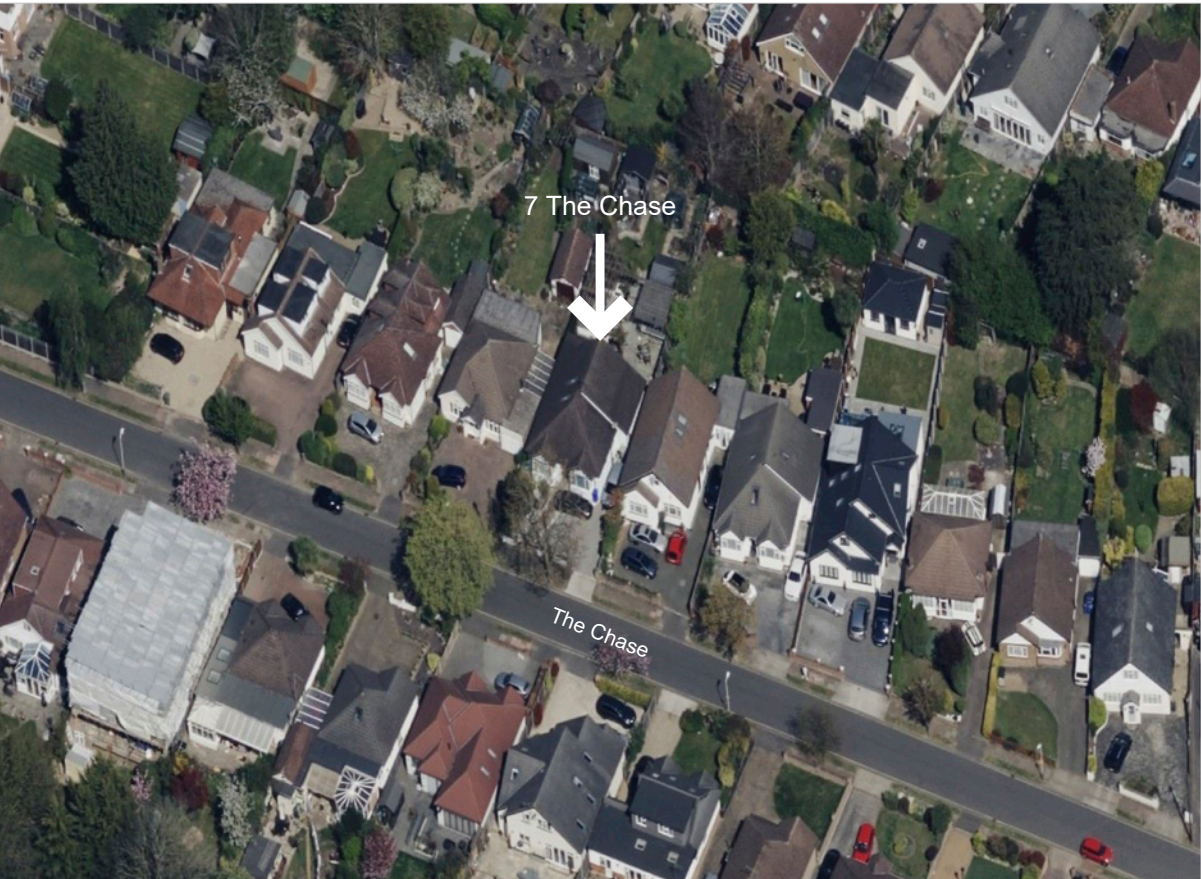
_____ Aerial Photo From South 1