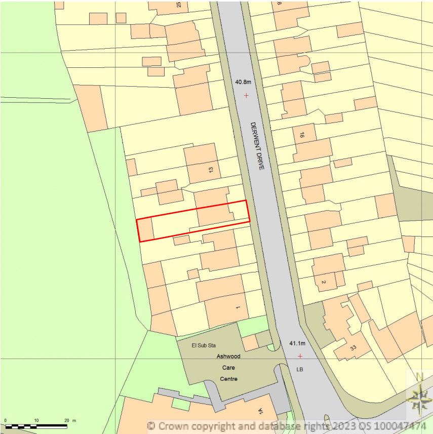
Location Plan@ 1:1250