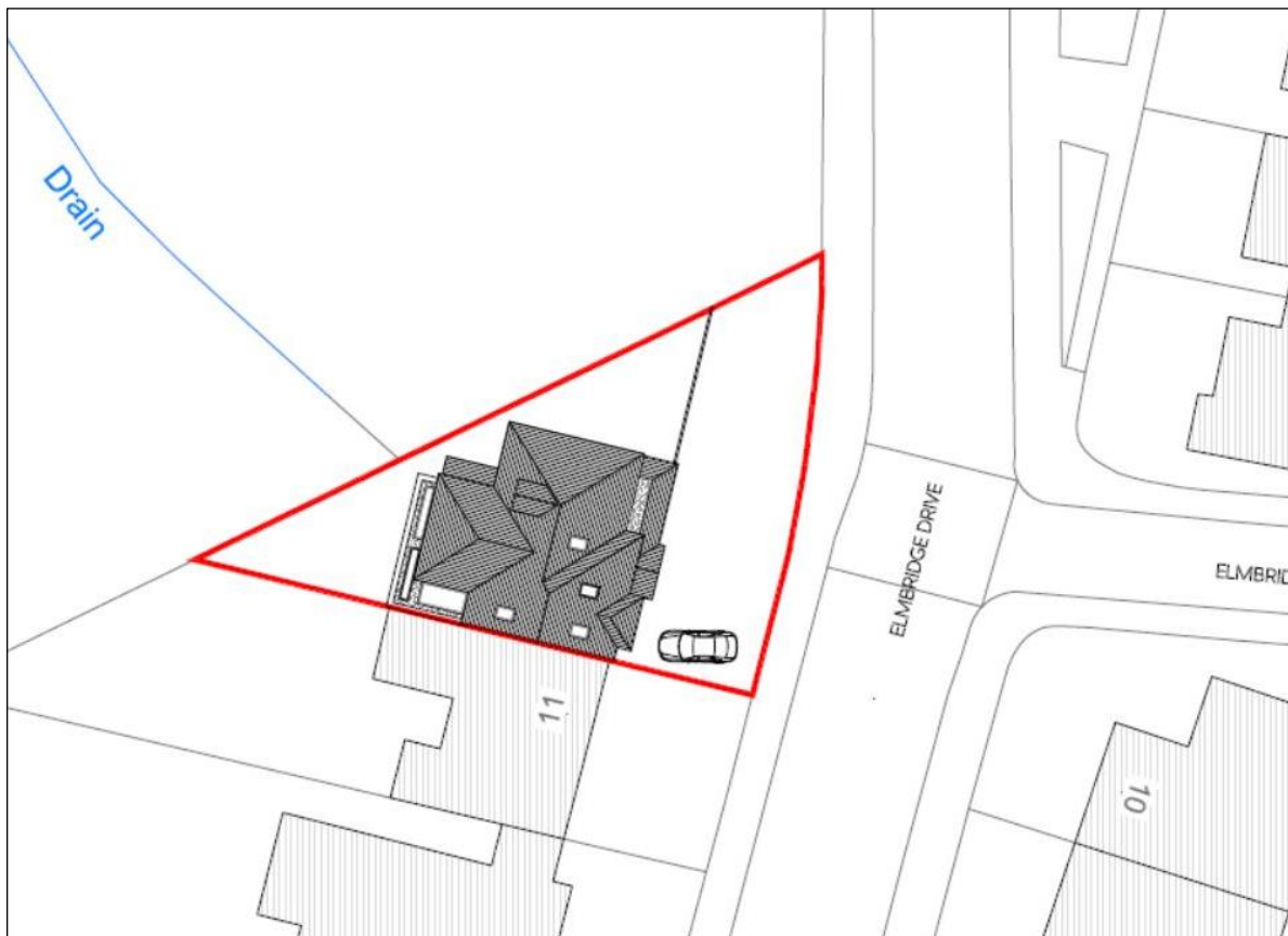
Figure 1 – Proposed Block Plan

This assessment considers all neighbouring properties near the proposed site, that could possibly be affected from the development.