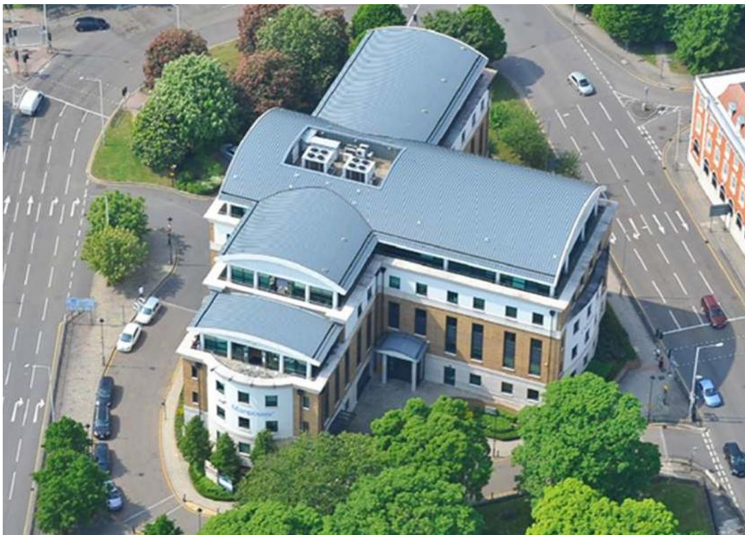
Figure 1 - Site Frontage

The site frontage is shown in Figure 1 below.