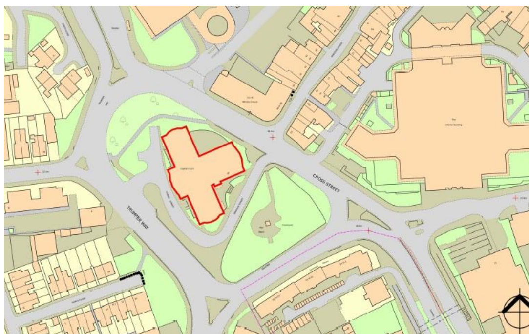
Figure 2 - Site Location

The general location is shown in Figure 2 below.