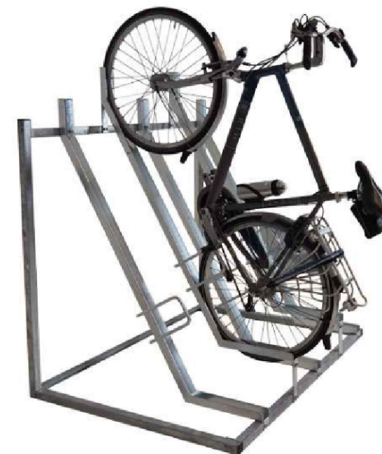
FalcoVert-Pro Cycle Rack