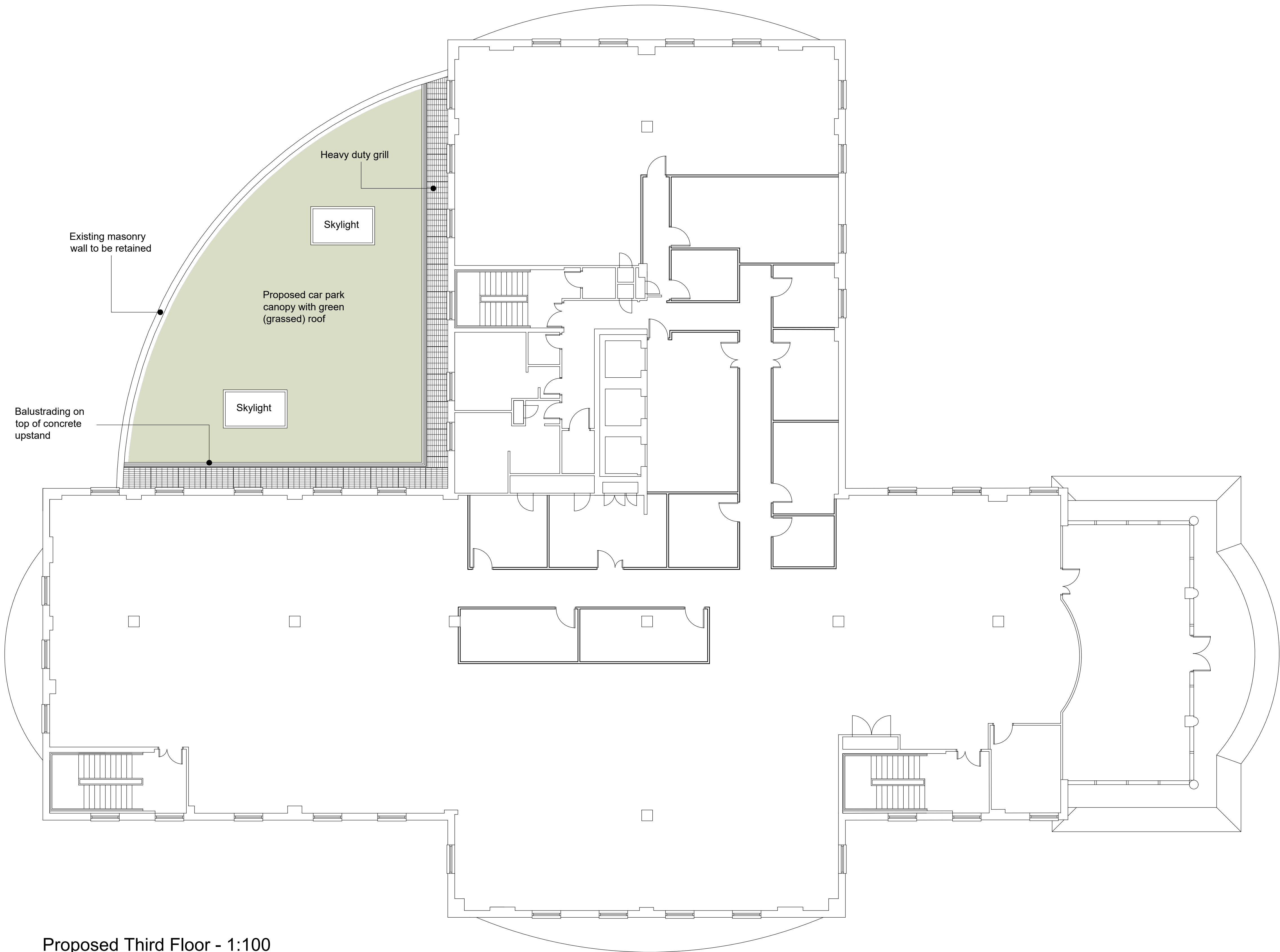
Proposed Third Floor - 1:100