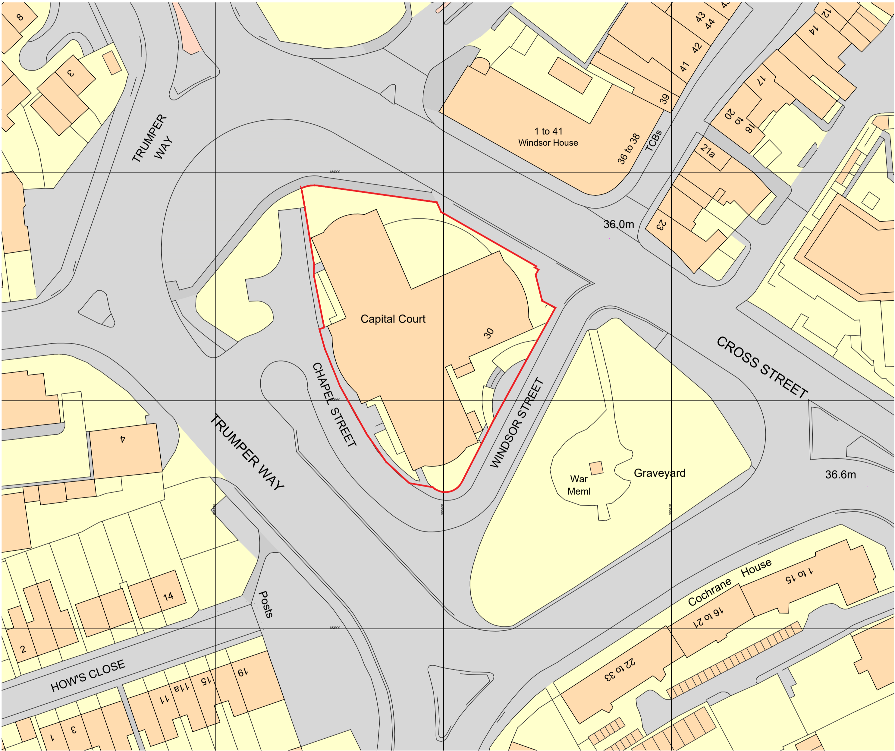
Block Site Plan - 1:500

specification: The Contractor is to comply with current Building Legislation, British Standard Specifications, Building Regulations etc. whether or not specifically stated on this drawing. This drawing must be checked against and read in conjunction with any structural or other relevant specialist and design documentation provided.