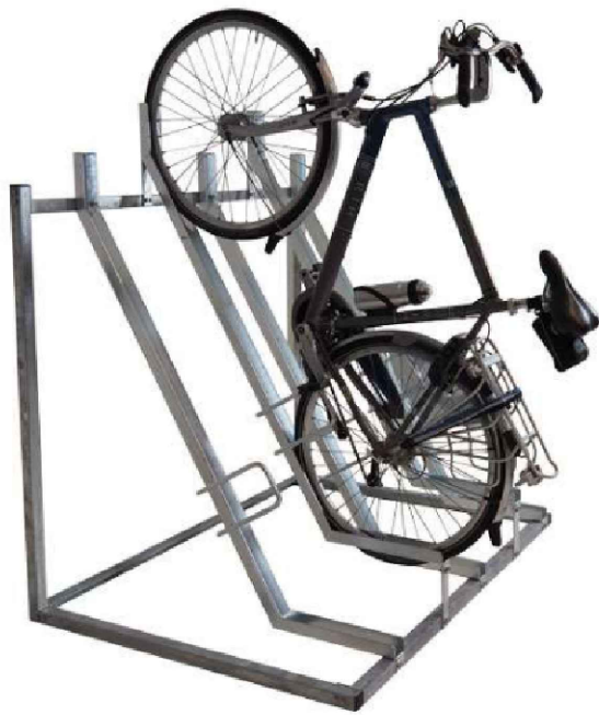
FalcoVert-Pro Cycle Rack