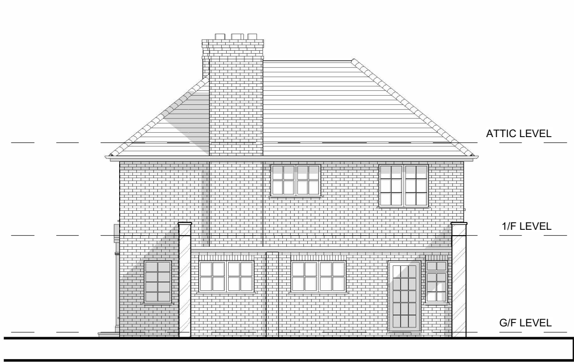
2 PROPOSED EAST ELEVATION (UNCHANGED)