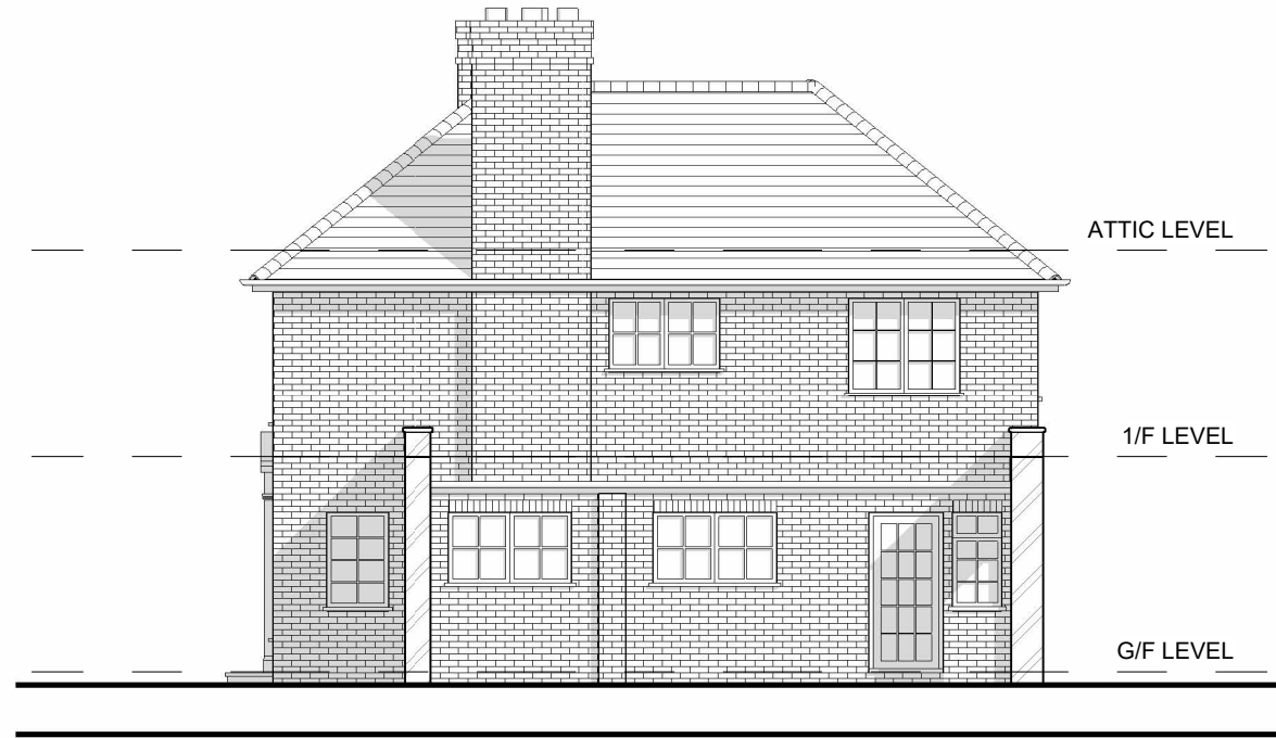
2 EXISTING EAST ELEVATION_