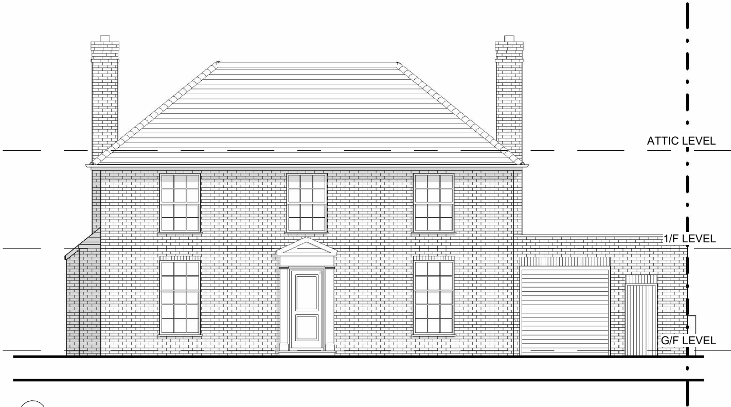
1 EXISTING SOUTH ELEVATION_