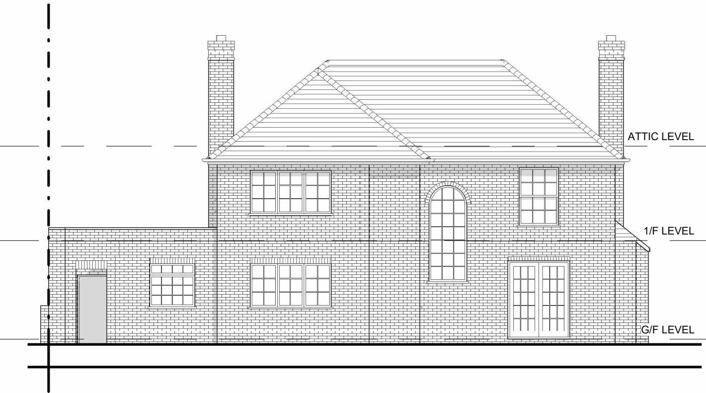
3 EXISTING NORTH ELEVATION_