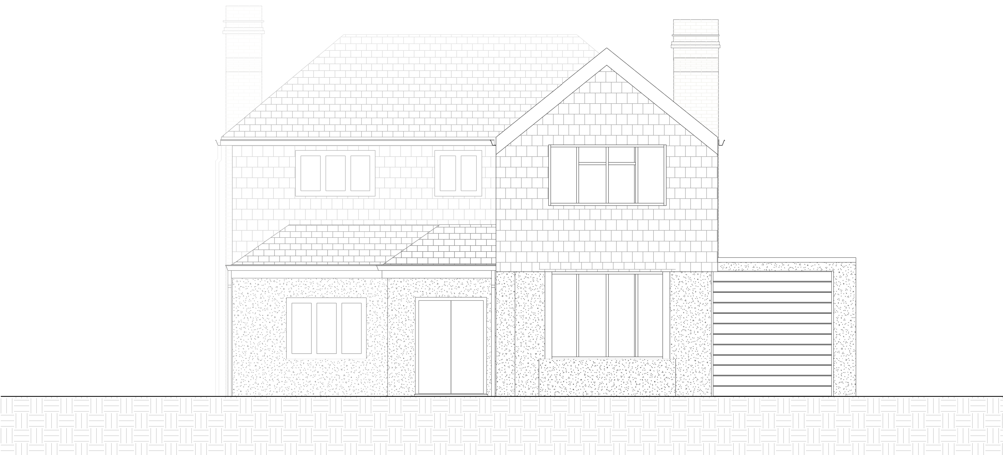
Proposed Front Elevation 1 : 50