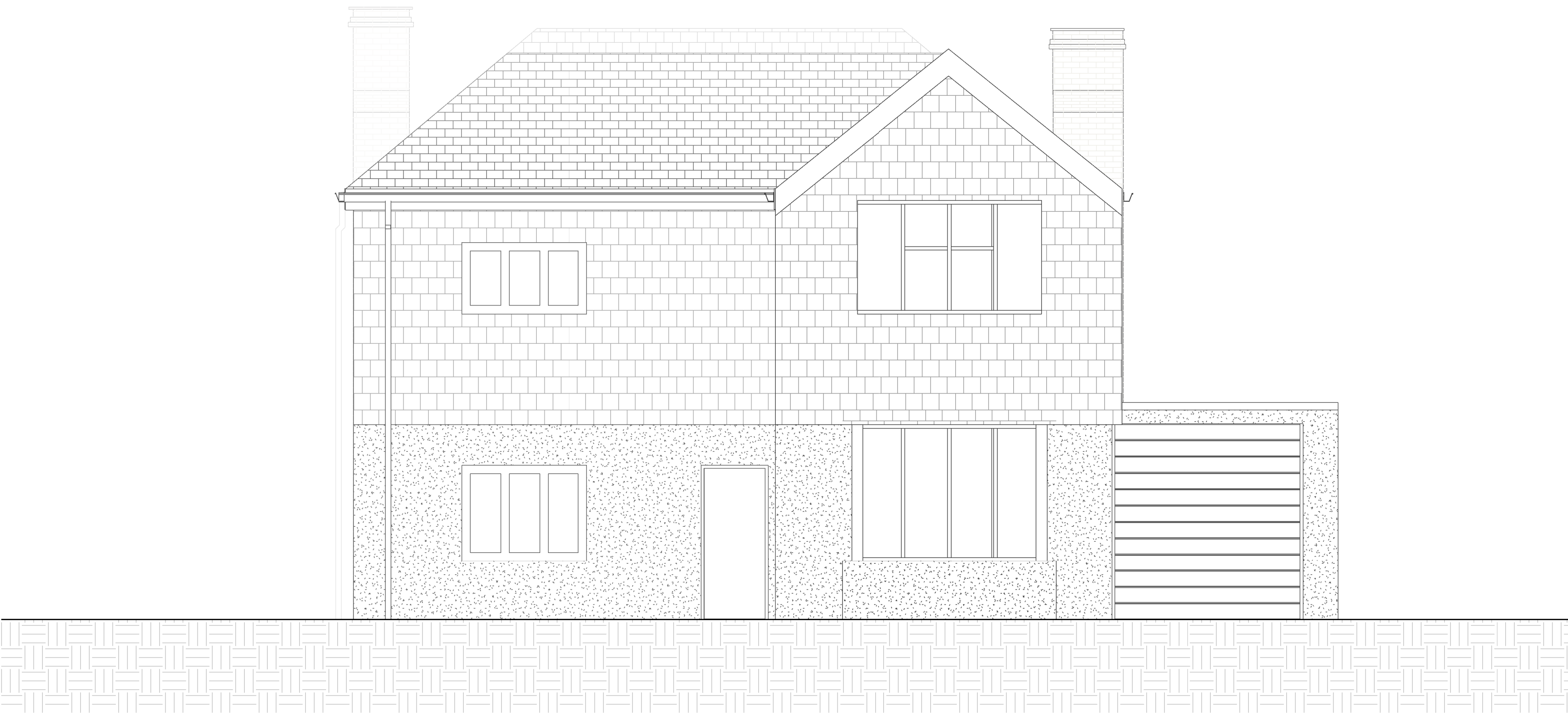
Proposed Front Elevation 1 : 50