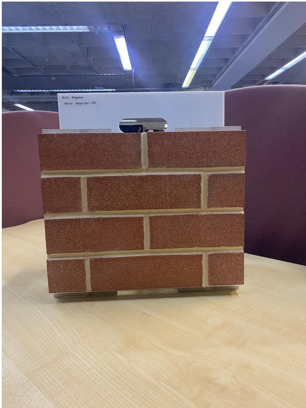
Red brick to be Ridgeway from Genbrix with Beige Clair mortar