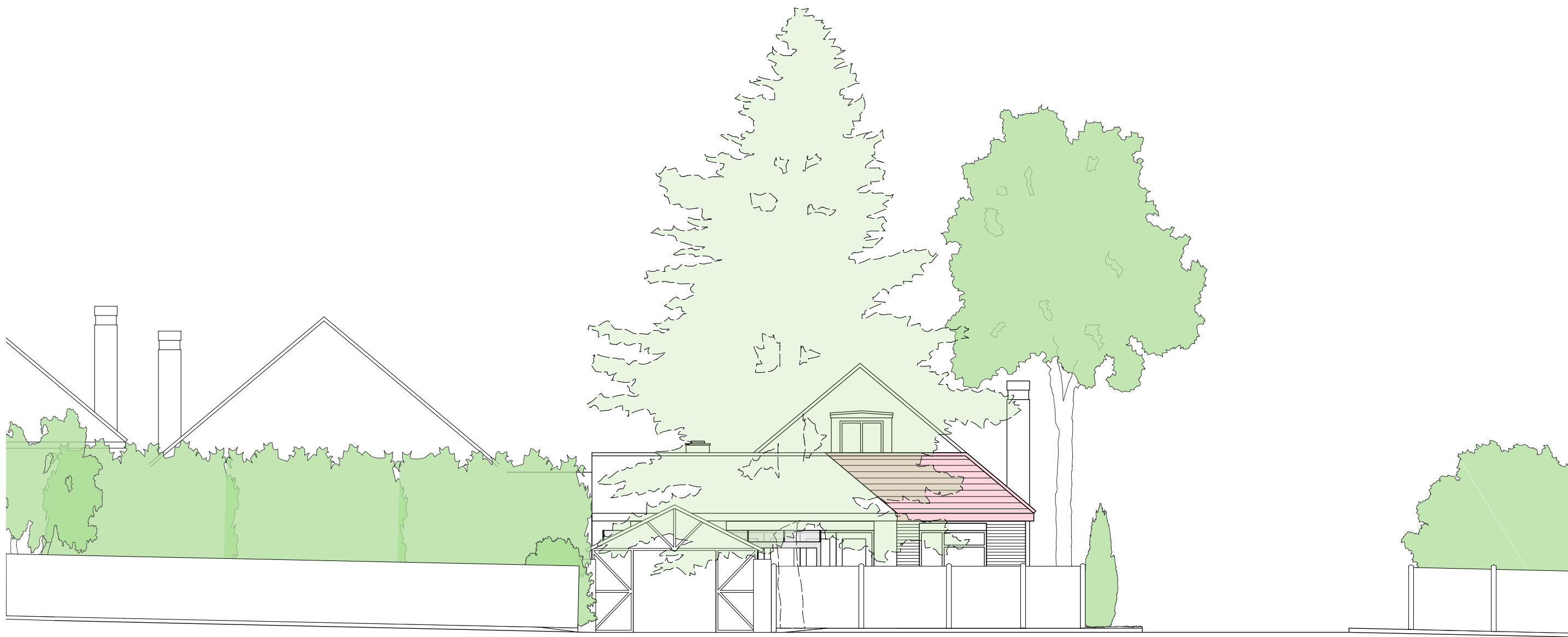
4 Proposed Dovecot Close Elevation