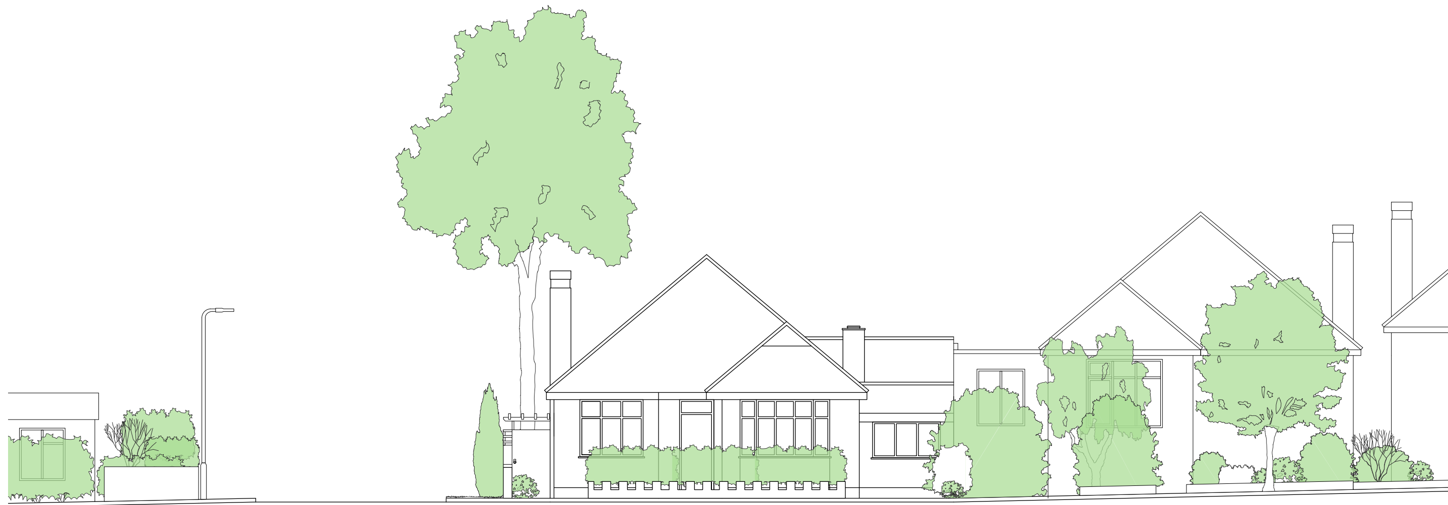
1 Existing Rodney Gardens Elevation