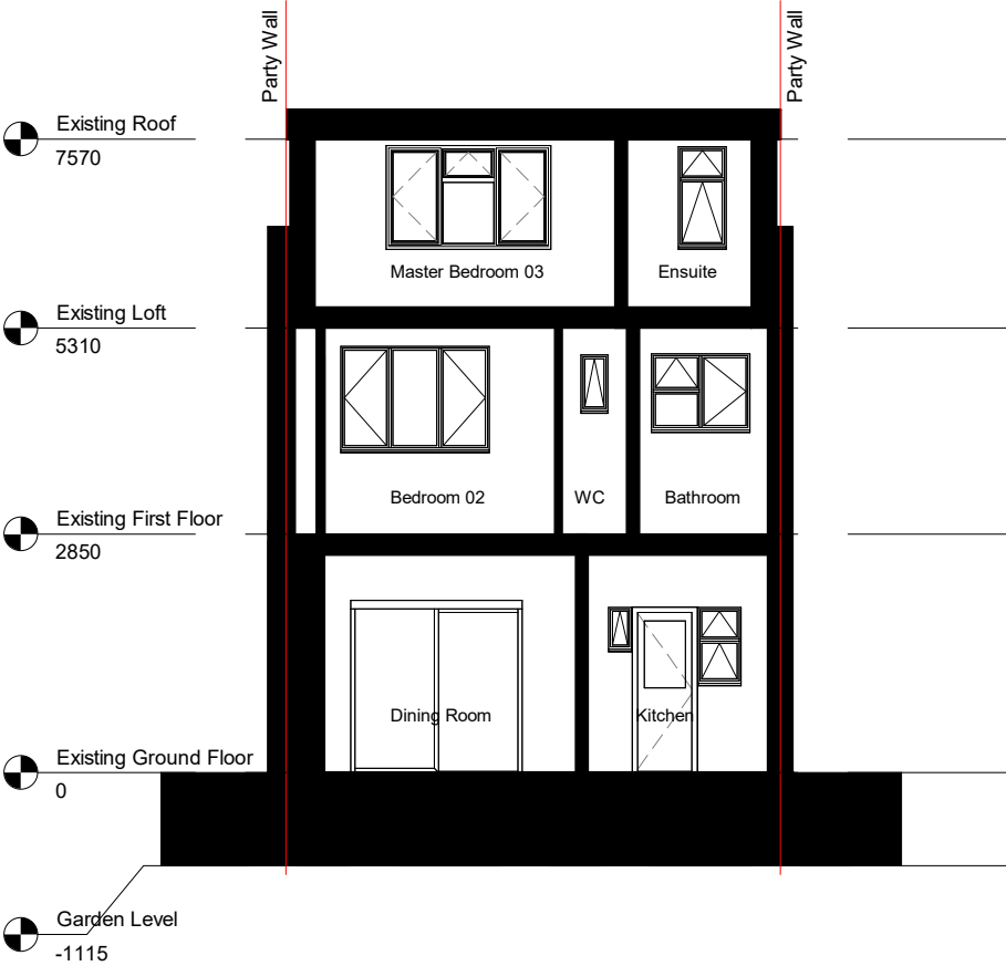
1 Existing Section 1 1 : 100

Issue Date 21.07.23 Checked PN Revision 3