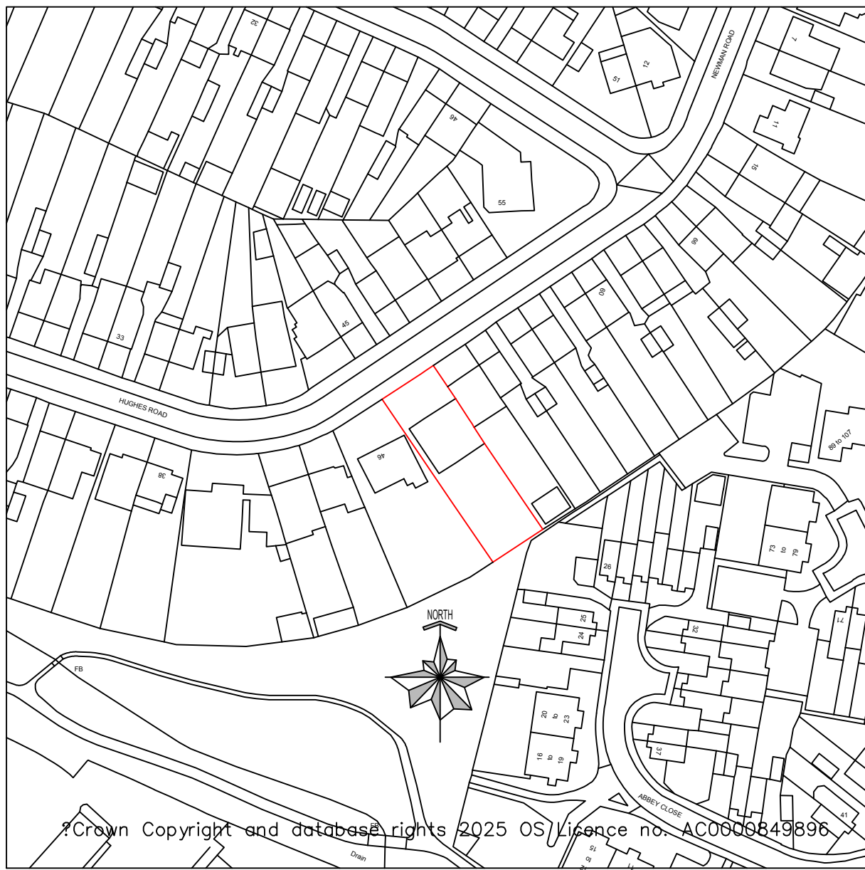
LOCATION PLAN SCALE 1:1250@A1