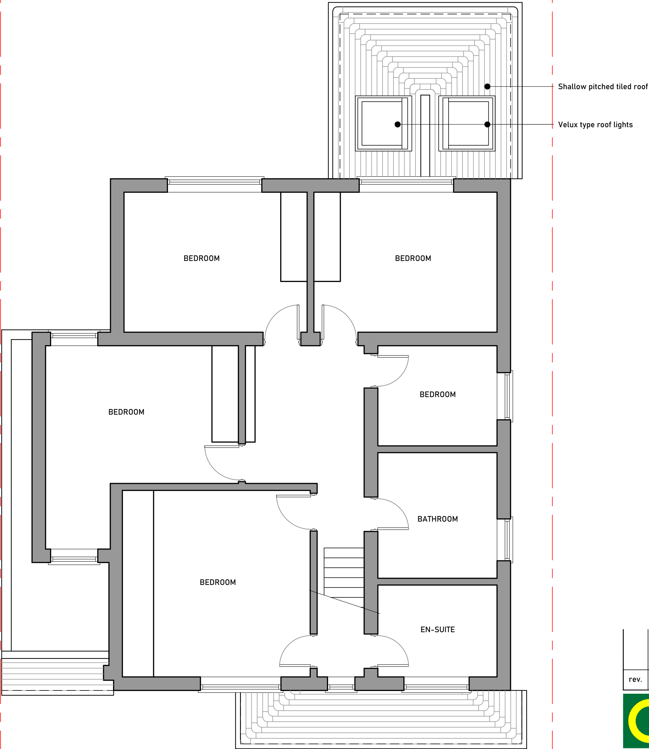
PROPOSED FIRST FLOOR PLAN scale 1:50