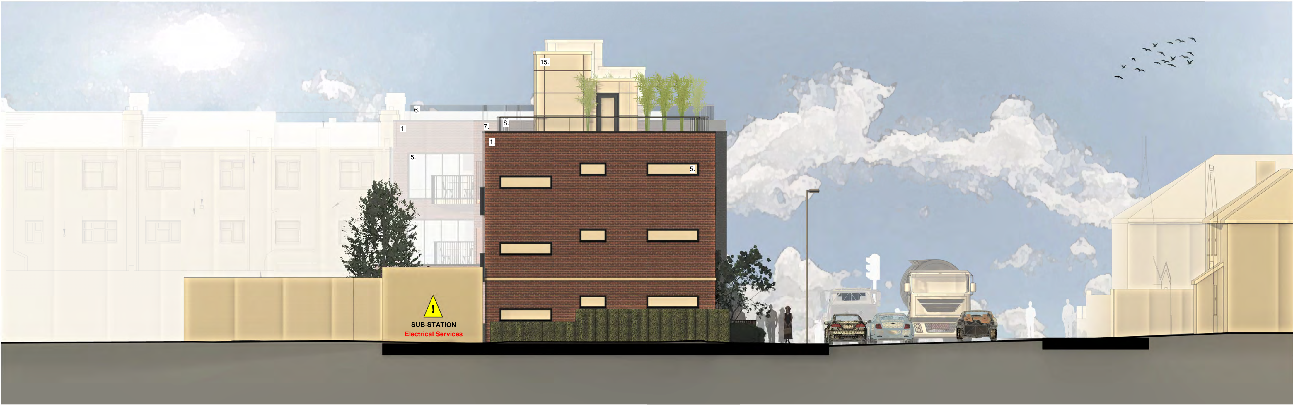
Rear Elevation 1 : 100

NOTE: Report all errors and omissions to the Architect. All dimensions to be checked on site before fabrication. Contractors must verify all dimensions on site before setting out, commencing work, or making any shop drawings. - All dimensions must be checked on site - All setting out to be checked on site - All levels must be checked on site and their datum confirmed - This drawing must be read in conjunction with the relevant specification clauses - This drawing must not be used for land transfer purposes