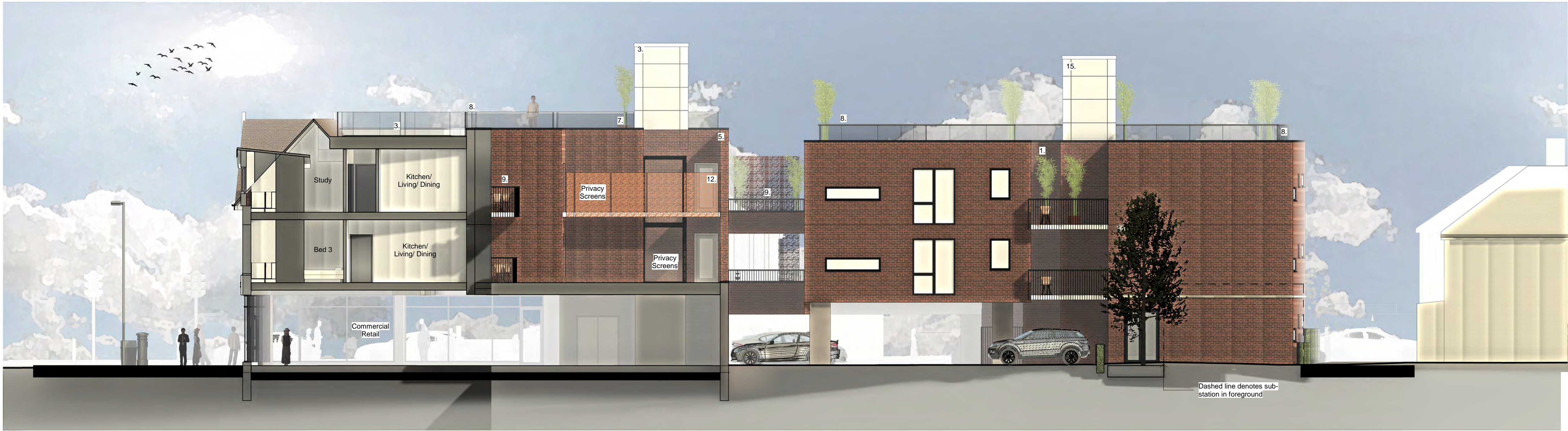
Side Elevation (Right) 1 : 100