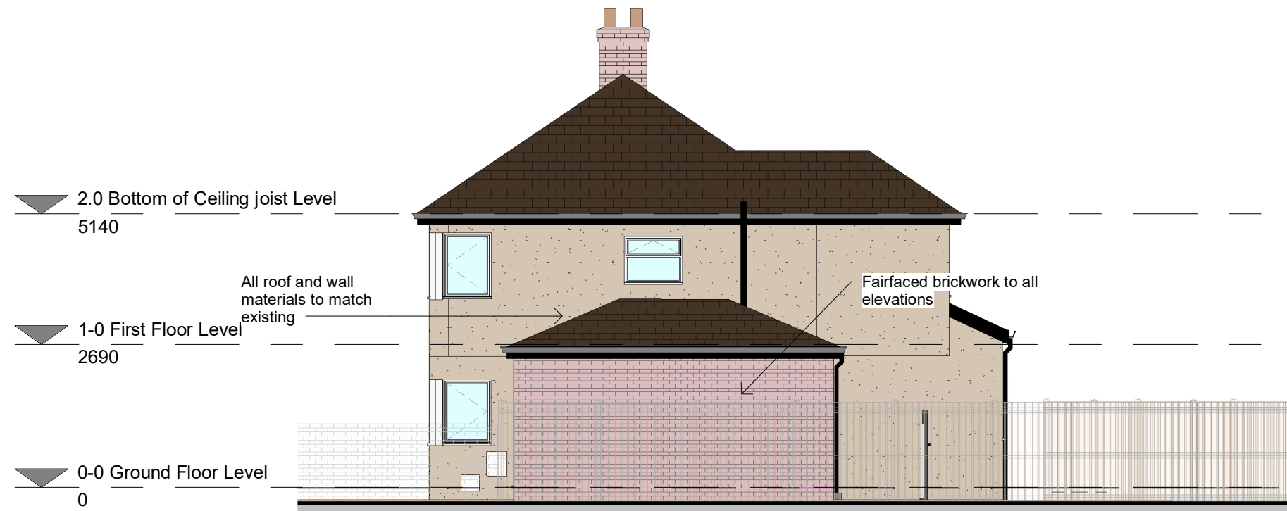
4 Proposed Side Elevation 1 : 100